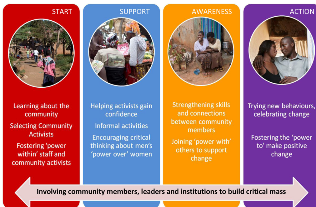
Fig. 2. The SASA! approach: how it works.

to conduct activities where people ordinarily congregated. The use of media and advocacy strategies by SASA! through small-scale media and street theatre also encouraged reflection and debate. Many SASA! activities were supported by a variety of contextually relevant communication materials . Training activities were offered to community activists to improve their confidence, skills, and ability to act as change agents within their community. The content of the various strategies evolved with each SASA! phase.