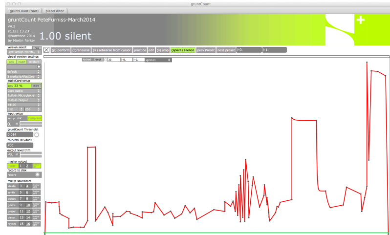
Fig. 2. The updated version of gruntCount . Setup procedure is ordered down the left hand column, including version and curve selection, an array of audio in/out settings, sample rate, vector size and microphone input(s).

within 30 minutes of downloading the software package. 4 Finally, full-screen display functionality is added for any laptop size, so that visual elements are optimally viewed and attention can be managed without irrelevant distractions. In April 2014, a remote application was added to allow for hands-free, on-stage operation of the main settings by the performer and for expression pedal control of overall output from the electronics. This small addition had the unintentional yet profound consequence of affording absolute control—a power of veto in effect—to the live performer, now able to suppress the electronics, fade in or out, or conclude the entire piece before the end of the curve. 5