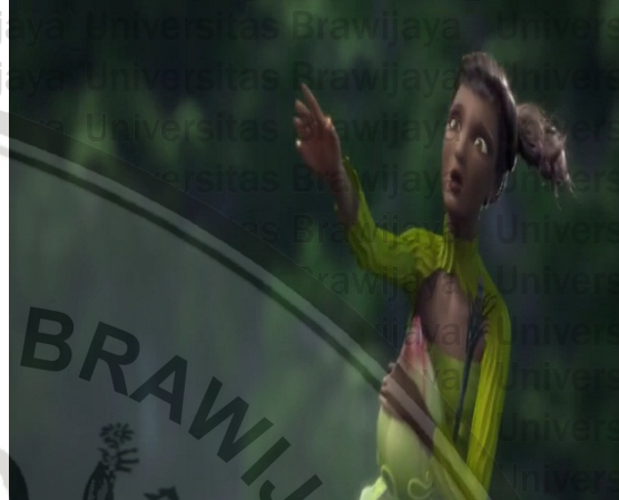
Figure 3.2.3.3 Queen Tara get stabbed by Mandrake's Weapon Source: Epic Movie, minutes 00:28:10

This picture tells that Boggan troops begin their attack to Moonhaven. They kill the queen to smoothen their plan. When the queen is killed, the living creatures have nothing to do to protect the area. This makes all the area of Moonhaven is under Mandrake's control and his troops. Dominance will make someone does anything.