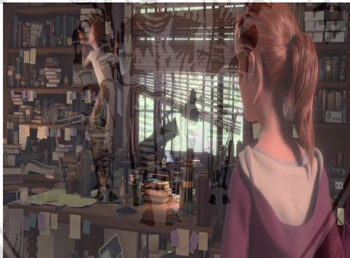
Figure 3.2.1.6 Mary Katherine Arrive To Her Father's House Source: Epic Movie, minutes: 00:06:56

Close up size emphasize that, there is relation between character and the condition in Epic movie that a girl is observing a frame in front of her. It can conclude that how important his natural research for the professor. So he is too busy with the research he does and he dose not that Mary Katherine has been arrived in his house.