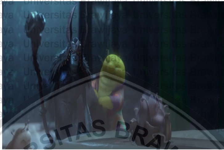
Figure 3.2.2.3 Mandrake wants to Take Bud

Long shot explain that Nim Galu tries to restrain Mandrake. Nim Galu wants to keep on exposing the bud with light in attempt to make it blooms. So Moonhaven forest can be preserve. However Mandrake wants to cancel on exposing the bud with light in attempt to make it blooms because he wants Moonhaven disappear and he becomes the king. The bud' color darkness which indicates that the bud is depraving.