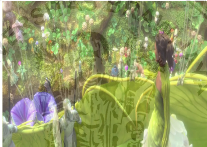
Figure 3.1.3 Queen Tara Greets Moonhaven's Citizen Source: Epic Movie, minutes: 00:16:43

In order to save the queen Tara, a warrior named Ronin plans to take buds silently before Boggan come. For her, the bud is very important so Ronin's idea is rejected by Tara. It should be taken by her because it needs sensitivity and natural instinct in taking the bud. She says that it is the best opportunity to find successor for her. Opportunity does not come twice so it is worth trying. She knows that it is very dangerous and she can die because Boggan will intrude the ceremony.