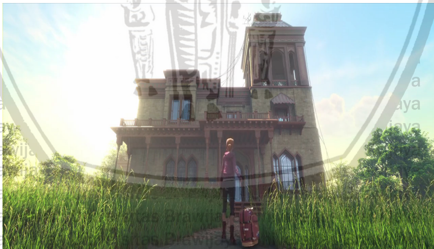
Figure 3.2.1.4 Marry Katherine Comes to His Father's House

Nature is an object that gives many profits for human research. Mr. Bomba character explains about how important of natural for human research. For him nature is important thing for his research more than his life and family. He only wants his research to be successful so he decides to move in the forest because city area does not support the scientists to conduct a research.