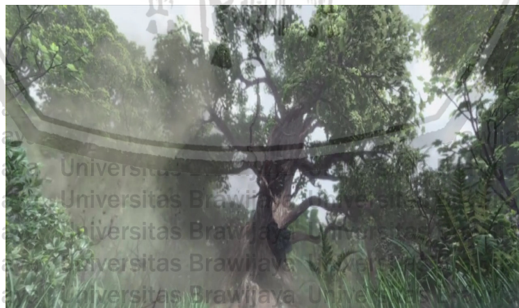
Figure 3.2.3.4 Damage of Moonhaven