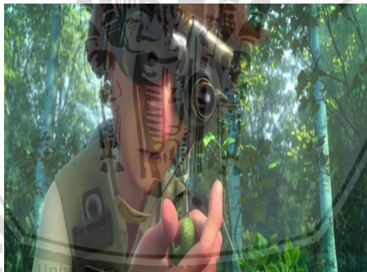
Figure 3.2.1.1 Mr. Bomba is Catching a Bird Source: Epic Movie, minutes: 00:02:11

Natural phenomenon is something interesting point to be analyzed by humans. They can improve their knowledge by finding new information in the nature. Epic movie explains about nature as human's research object. Mr. Bomba uses nature to conduct his research.