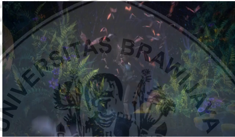
Figure 3.2.1.7 Mr. Bomba Have Been Chasing By Bats Source: Epic Movie , minutes: 01:26:19

Mr. Bomba's obsession of research makes him create new supporting devices. He has bat sounds on his iPod. It functions to study about bat. In his opinion, insects have different dimension from other animals so he needs special device to support his research.