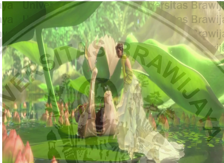
Figure 3.1.4 Queen Tara and Snails

her successor, she asks two snails in there for their opinions. The snails give her suggestion. Queen Tara use the suggestion as further consideration before choosing the bud. Because of her wisdom and friendliness Queen Tara becomes favorite for all the citizens.