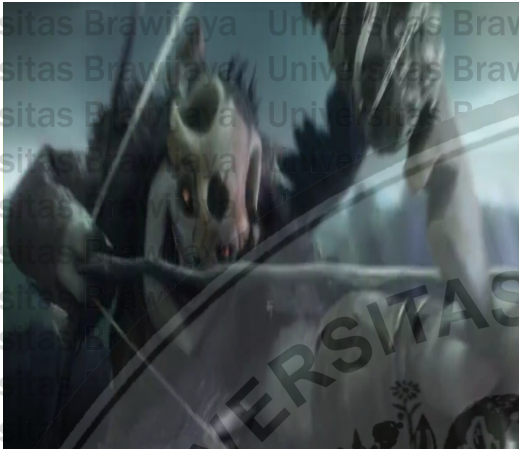
Figure 3.2.3.2 Mandrake kills Tara

The wrong concepts people have in mind will only cause the nature becomes the victim. They will destroy the nature to get their purpose.