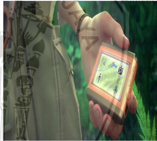
Figure 3.2.1.3 Safety Sensors