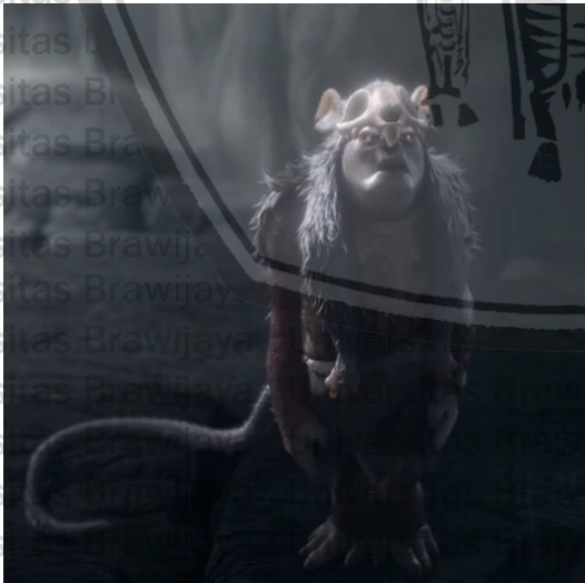
Figure 3.2.2.1 Boggan or Mandrake's Son

Boggan and Mandrake destroy nature to become the leader of Moonhaven.