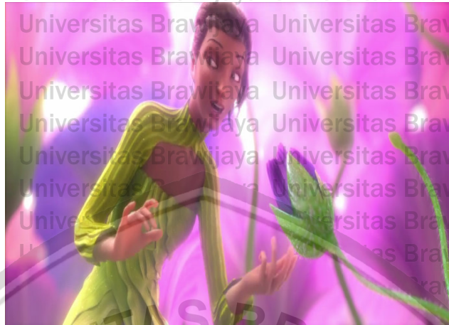
Figure 3.1.2 the Cheerfulness Expression of Queen Tara to the Nature