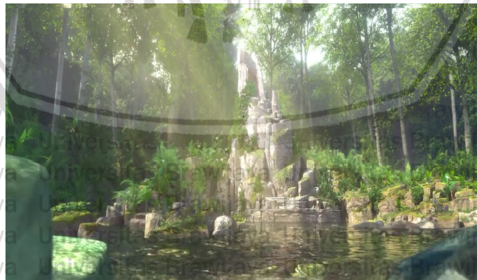
Figure 3.1.1 Beautiful Waterfall before Entering Moonhaven

Moonhaven is a beautiful small green area in a forest which becomes the heart of all the forest area. There are many creatures like animal, plants and leafmen live in there. This peaceful area is ruled by a queen named Queen Tara. The creatures in Moonhaven are very dependent upon the queen because she has a power to control the forest. Before entering the Moonhaven, there is a beautiful waterfall which covers the place. The waterfall is very high and rocky. This condition makes Moonhaven becomes unseen and hidden.