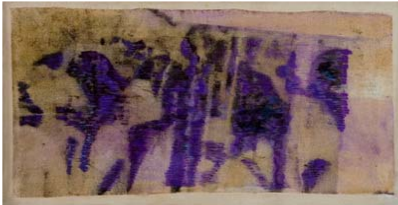
Figure 5. Bracha L. Ettinger, Eurydice n. 14 , 1994-98, oil and photocopied dust on paper mounted on canvas, 51.5x 20 cm.