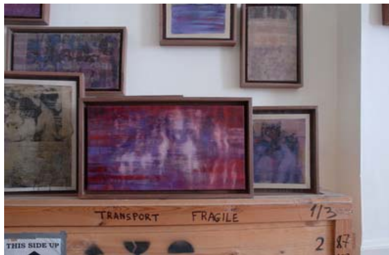
Figure 10. Detail of installation of Eurydice and No Title Yet paintings by Bracha L. Ettinger in the Freud Museum, London, June-July 2009.