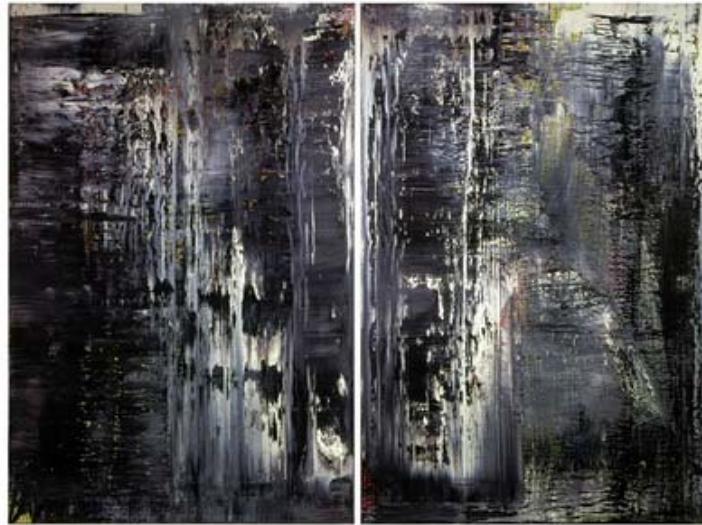
Figure 12. Gerhard Richter (b. 1932) November , 1989, oil on canvas, 320x400 cm, St. Louis Art Museum. Reproduced by kind permission of the artist.