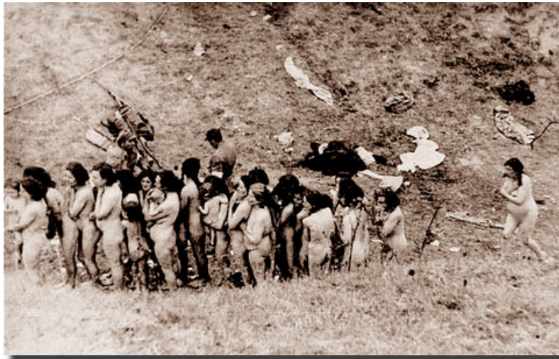
Figure 3. Women and Children before an execution by German soldiers, Mizocz, Rovno, Ukraine 14 October 1942 , photographed by Sergeant Hille of the German Gendarmerie, USHMM photograph no. W/S 17877; photograph used by Alain Resnais in Night and Fog (France, 1955) Public Domain.