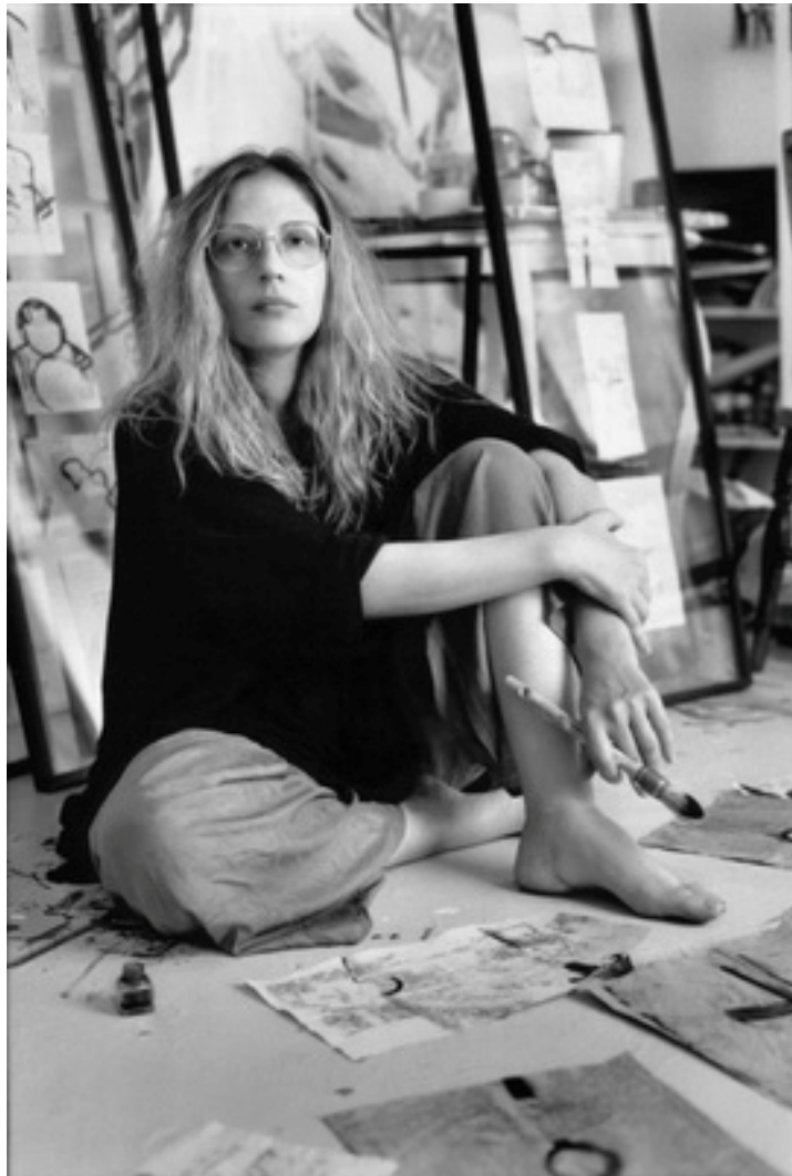
Figure 1. Bracha L. Ettinger in her studio, Paris, 1989.