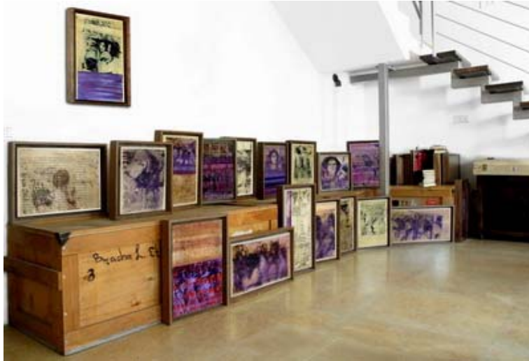
Figure 9. Installation of Bracha L. Ettinger's paintings in her studio, Tel Aviv 2009.