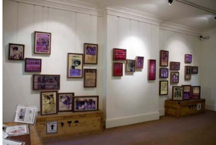
Figure 11. Installation of Bracha L. Ettinger paintings in Resonance, Overlay, Interweave , Freud Museum, London, 2009.