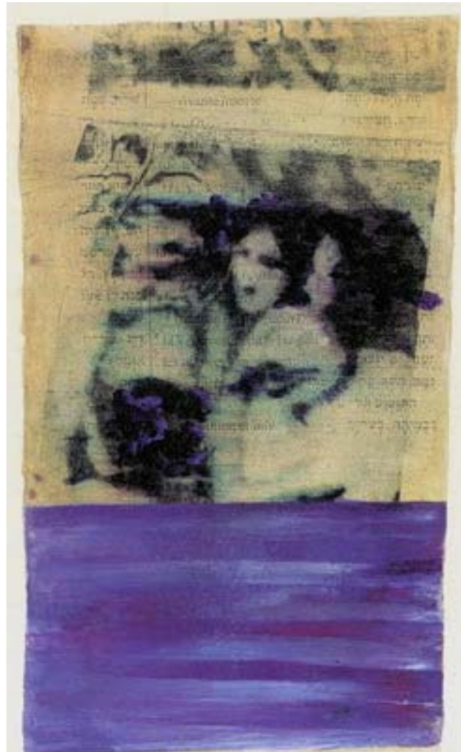
Figure4. Bracha L. Ettinger, Eurydice n. 5 , 1992-94, oil and photocopied dust on paper mounted on canvas, 47x 27 cm.