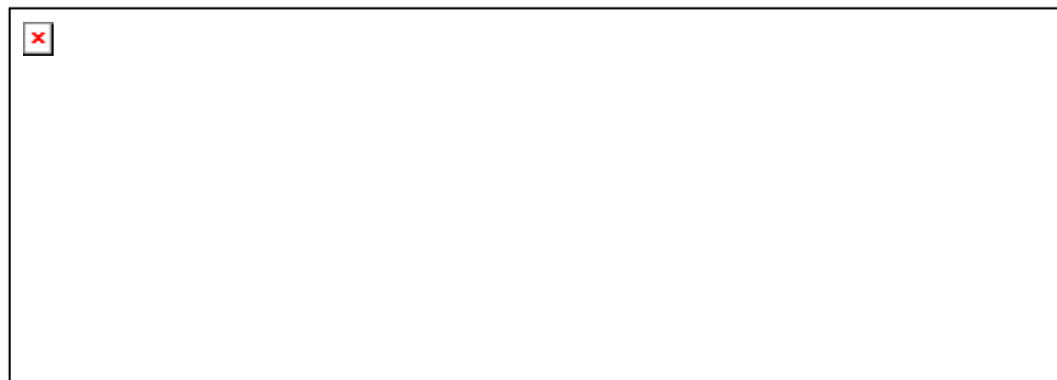
Figure 1: phpSyntaxTree is a web application available under GNU General Public License from sourceforge.net. One departure from convention in this parse tree is the use of Brown POS tags to identify parts of speech at terminal nodes. http://sourceforge.net/projects/phpsyntaxtree

A full parse of the above sentence from Winograd [8] shows that while prosodic structure is linear, syntactic dependencies create a multi-layer structure, traditionally represented as a parse tree: