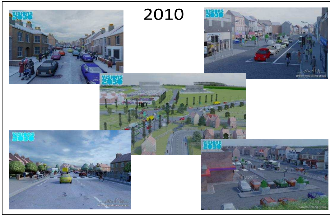
Figure 1: Street scenes in 2010