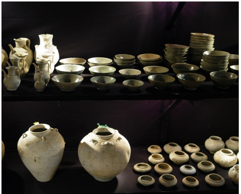
Photograph courtesy J.P. Blancan 2009