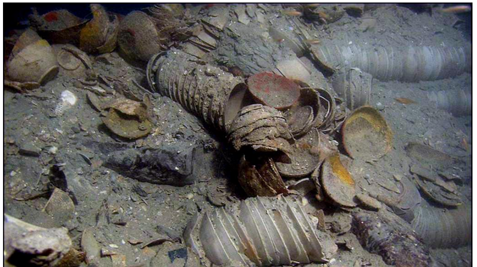
Video capture courtesy Yves Gladu, 2004