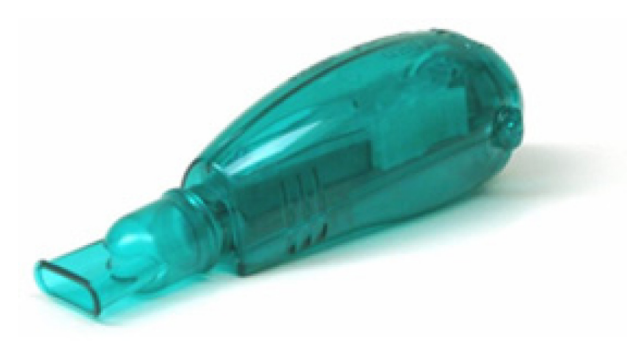
Figure 2 The acapella® physiotherapy device (Smiths Medical, St Paul, MN, USA).