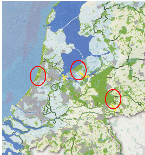
Figure 1. The location of three “near natural” nature reserve areas in The Netherlands: Kennemerland (left), Oostvaardersplassen (middle) and Veluwezoom (right).