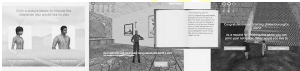
Figure 1. Screenshots of Personal Investigator.

PI was designed by a multi-disciplinary team, involving both technical and mental health care professionals. A critical factor in the design was to ensure that the game would not distract from the therapeutic process. While adolescents can find computer games engaging, there was little point in developing a game which, while deeply engaging for the adolescent, does little to assist in achieving therapeutic objectives, such as engagement with the therapist and with the therapeutic process. To be successful, the aim was to achieve a balance, whereby an appropriate level of engagement with the game enhances the client's engagement with the overall therapeutic process.