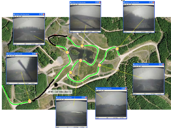
Figure 2: Views from in-car camera as seen by users