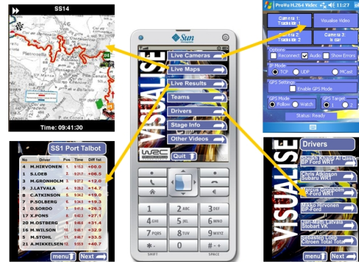
Figure 3: VISUALISE User Interface

selected live video streams together with timing and GPS data. Plasma screens were placed to display this public content.