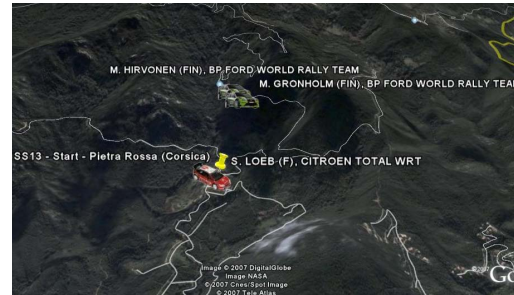
Figure 4: PC mapping display

3) PDA/Mobile device GPS distribution: A Java application was developed to display GPS data on spectator phones. The interface was device independent and easily installed onto mobile devices. This application differed from the PC version in that car overlay icons were placed onto a static map, with the same functionality. On the day of the rally this system enabled spectators to view live and personalized GPS data and historical data from previous rallies on their mobile devices.