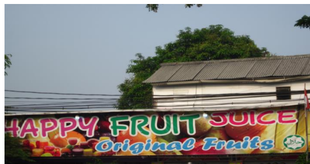
Figure 4. Juice made of original fruits

When noting the research of Landry and Bourhis (1997) regarding the power and status of one language over the other, it might be possible to conclude that information about food and nutrition is rightly within the responsibility of the government of Indonesia, and through its official language, Indonesian (94%).