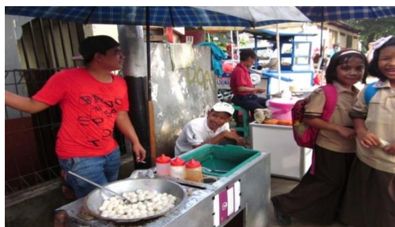
Figure 9: Example of images related to food sold outside school building

Some of the texts and images related to food and nutrition were also found outside school buildings, as can be seen in Figure 9.