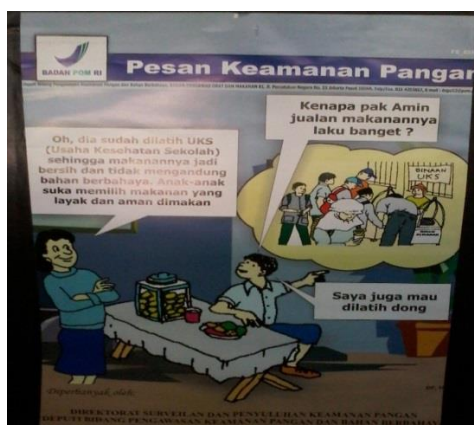
Figure 12. Example of texts with embedded “good” food and nutrition message

Figure 11 explains the importance for food vendors in school canteens to join a training held by health school unit so that they will only sell clean food that does not contain dangerous food substances.