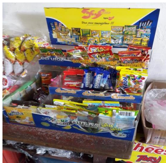
Figure 7: a range of snack foods displayed for sale at a school canteen.

Figure 8 is an example of a health campaign in a schoolscape. It also shows a Tupperware (a plastic food container multinational company) advertisement, which contains an educational message. This kind of health campaign from various health and food products is written in Indonesian.