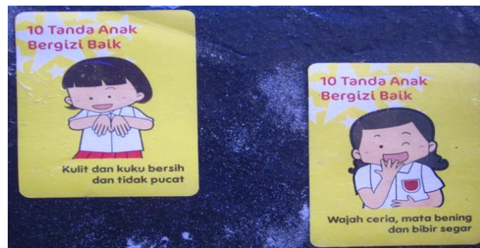
Figure 1. Wall posters in a classroom - Ten signs of Good Child nutrition: clean, not pale, skin and nails, bright face, clear eyes, and moist lips

Only a small percentage of the food, nutrition and health images in the schoolscales are written in English, Japanese or Arabic. Japanese is, like English, a language of international trade and commerce, and appears on some packaging of imported snack items (see Figure 3). English and Arabic are both found on a large advertising banner in one schoolscale. Figure 4 shows English used with nothing more in mind than to provide a short, sharp message about the effects of enjoying fruit juice, and the 'original' or 'real' fruits used to make the juice. Arabic is found in the "halal" sign at the bottom right of the poster, indicating the juice is produced through an officially/religiously endorsed company.