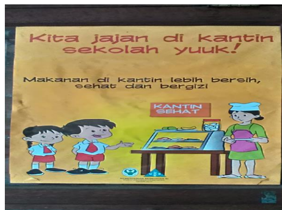
Figure 6. Let's buy snacks in our school canteen! The food in the school canteen is cleaner, healthier and more nutritious. Healthy Canteen.

Figure 7 is an example of a food display – a range of snack foods displayed for sale at a school canteen. Languages evident in this display are English (cheese) and Indonesian ( 50 tahun - terus pacu semangatmu – 50 years, keep up your spirits).