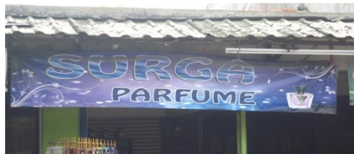
Figure 16. A perfume advertising banner

suggested in this linguistic landscape snapshot study. The findings show that the linguistic landscapes around schools have many texts related to food, nutrition and health campaigns (89%), yet also some cigarette and other products advertising (11%). The various languages convey messages for different purposes. Indonesian as the main language used is the language of curriculum delivery, Arabic relates to the religious preparation of food, Sundanese, Japanese and English relate to other aspects of food, health, nutrition and life.