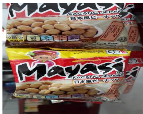
Figure 3. Japanese Peanuts

Only a small percentage of the food and nutrition data in the linguistic landscape is written in English. This is not surprising because Indonesian is used as the language of instruction in schools although the number of texts and images written in English is increasing. Figure 4 is an example of texts written in English.