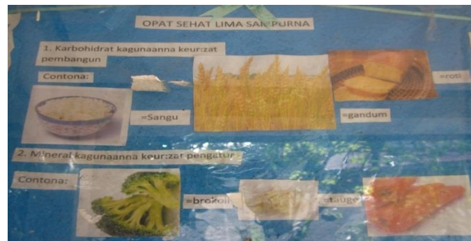
Figure 2. Student-produced poster of nutritious food (Sundanese) – Four Healthy Five Perfect Food (The 4 healthy food are carbohydrates (usually represented by rice), protein (usually represented by meat or fish), vegetables (usually represented by green vegetables), and fruits. The 5th “food”, which makes the nutrition program “perfect” is milk.