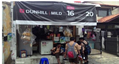
Figure 15. A cigarette advertising banner

Figure 16 does not advertise “unhealthy” products, but it is an advertisement, just the same. It advertises Surga (Heaven) Perfume, and it was found on an advertising awning outside a shop opposite a school. There are many images of this kind around school buildings in both cities.