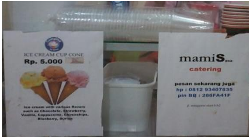
Figure 5. English and Indonesian signage on a canteen counter selling ice creams