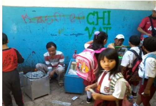
Figure 14. Authentic but not officially-endorsed food vending outside the school building