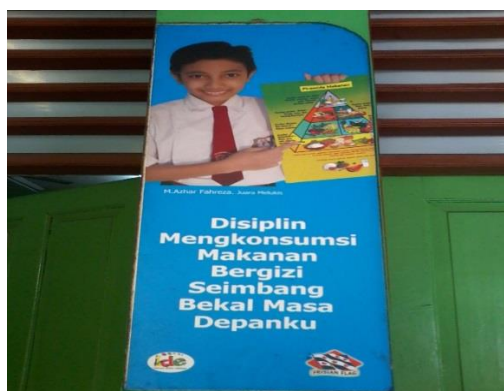
Figure 10. Being disciplined to eat only balanced nutritious food is your storage for the future

In addition to this, there is also a text that provides students with some information that explains why students are not allowed to buy food arbitrarily (see Figure 11). This information is also part of the school materials that students have to learn. Posters and texts like this one are around schools to remind students of what they have learned in class.