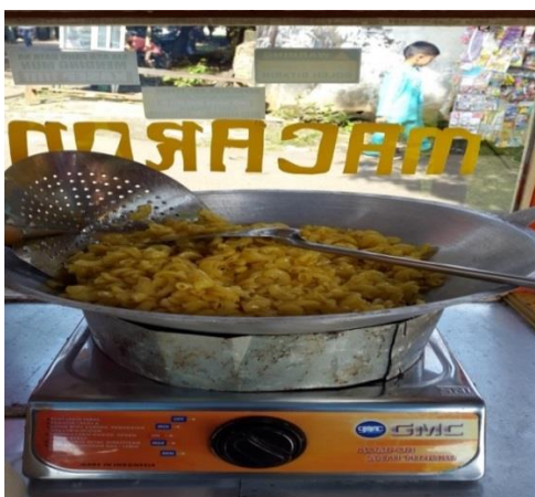
Figure 13. Example of authentic images around school building that is not officially endorsed

schools’ walls or noticeboards contain “healthy” messages, the reality shows that students are actually exposed to a lot of unhealthy food in the school compound, inside and outside the school building. Figure 13 shows one of the students’ favourite snacks, fried macaroni. It is considered unhealthy food because the oil used for frying macaroni is often used many times so that it becomes dirty – even dangerous – for our health. In addition, to make the food more delicious, the food vendor usually uses additives -- substances which are considered as “unhealthy”.