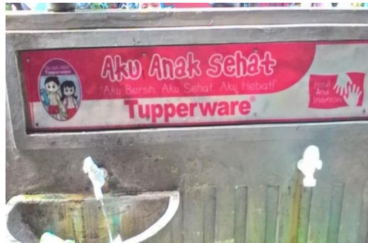
Figure 8. I'm a Healthy Child: I'm Clean, I'm Healthy, I'm Fabulous - Tupperware – Caring for Indonesian Children.

The various images gathered (examples in Figures 1 – 8) were collected inside and outside the school perimeters, and inside the schools were photographed on walls, gates, doors, hanging from ceilings, placed at water-fountains, and outside the school gates were on roadside signs, or displayed on or around food vendors' stalls.