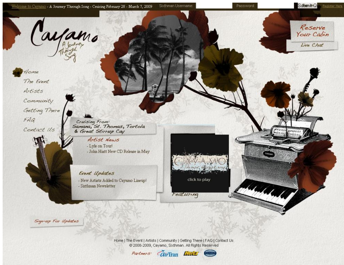
Figure Five: Website for Cayamo 2009

You Tube. Of course, we might ask ourselves if these communication methods are effective when targeting their music loving audience and, whilst Sixthman bask in their success, will the audience return to see many of the same artists or will they look for something new? Indeed, with the 'credit crunch' of early 2009 providing a financial challenge for many, will Sixthman be able to repeat its success with Cayamo?