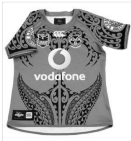
Figure 2: New Zealand Warriors 'Heritage' Rugby League shirt 2000 (Warriors Merchandise NZ, 2010)

This research validates the thought processes of different cultures (in particular Polynesian culture) in encapsulating their centuries-old cultural tattoos as a form of reflective consideration. The tattoo shown below (Figure 3) may be perceived as a critical reflection, even though there is very little in the way of written words. Reflections, when interwoven with experience (reflecting-in and reflecting-on action) (Schön, 1983), can be used to form a reflective journal. Whichever format the reflection is realised in (written or tattoo), it becomes a valuable learning tool, which may be designed around how the individual learns best (Flecknoe, 2006).