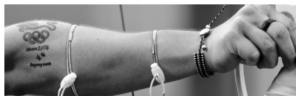
Figure 6: Archer Laurence Godfrey awards himself a new tattoo for each Games he competes in

Te Awekotuku (2007) describes a similar process as an opportunity for wearers to cement their unique relationship with a ritual or practical matter such as a milestone, a record of an ancestral deed, secret or dream, and it is this internal thought process that suggests that specific forms of tattoos can provide deep and meaningful reflection to the wearer. Moreover, these tattoos can also provide an extended opportunity for reflection which enables the inked individuals to use their tattoo as their own personal expression of how specific decisions have been made – according to Flecknoe (2006) this is the 'reflexivity bit' and it is also the crucial part of Kolb's (1984) "observations and reflections" and Entwistle's (1997) "looking for patterns of underlying principles". According to my own theory of 'personal or internal' reflection (Figure 1) it represents personalising the history or experience.