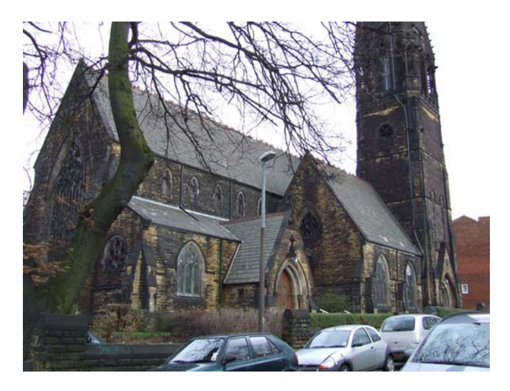
'Nice building, sad it's not used' 'Renovate it! Use it!' 'Make it into a wacky warehouse type place'