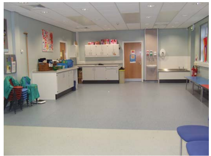
'Good space to play' 'Enormous space' 'Clean, tidy' 'Very nice, clean, tidy, inviting' 'Great baby clinic, friendly and fun' 'Spacious, functional and fun to play there too'