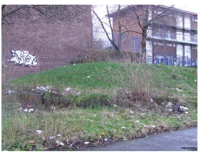
'Get it cleaned' 'Disgusting'