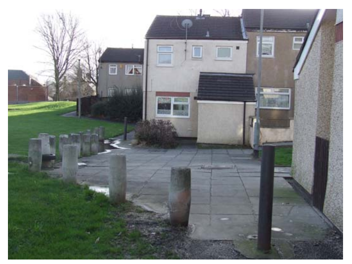
'A big improvement' 'Mess