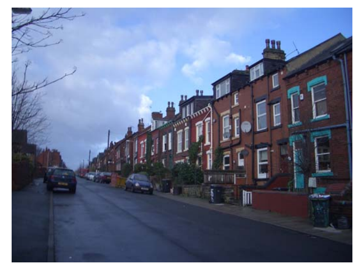
'Good street for roller skating' 'Heavenly'