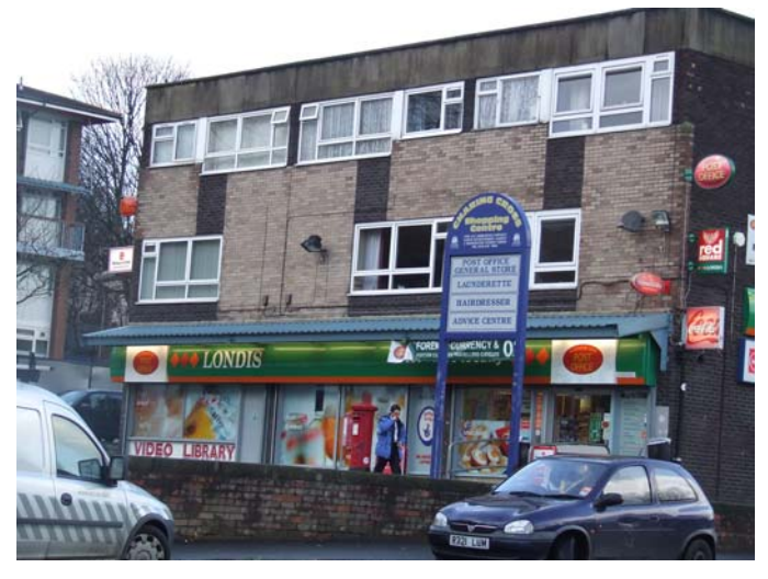
'Good shop' 'One stop centre'