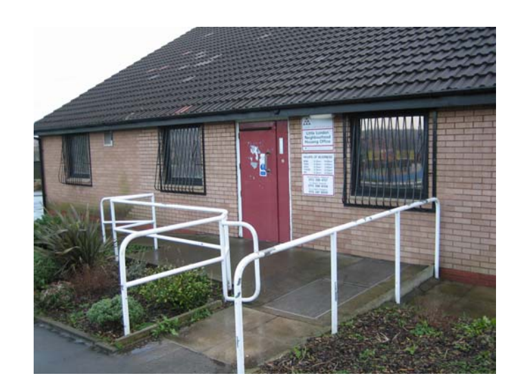
'Not good' 'No graffiti, fantastic'