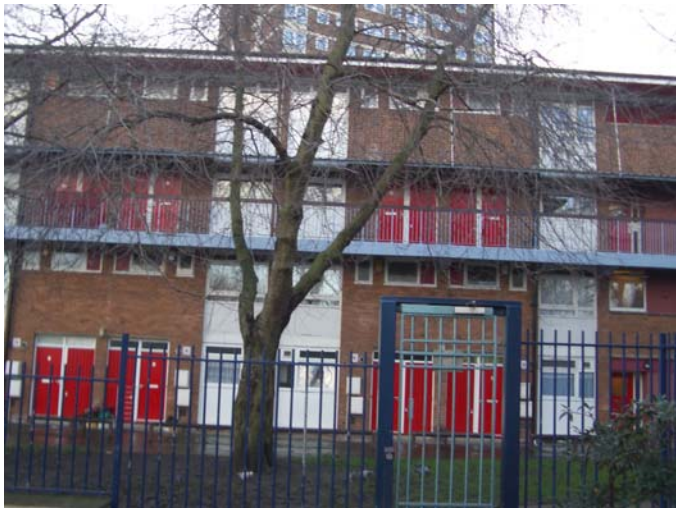
'Clean & tidy'