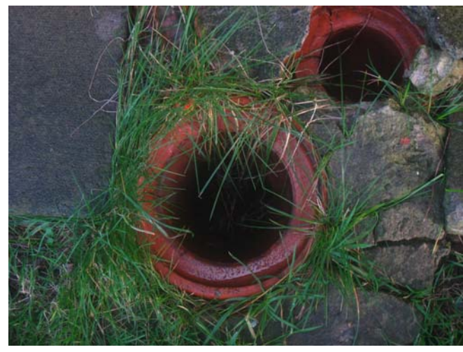
'Too dangerous' 'Dangerous' x 5 'A lot of things are dangerous but being a good parent you wouldn't let your child run off in front' 'Disgraceful, needs sorting urgently'