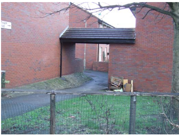
'Get council to keep on top of removal' 'Keep it tidy' 'Clean it – fine dumpers' 'Again, why?'