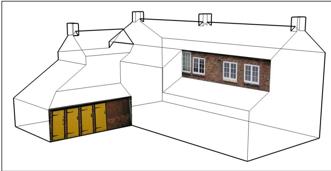
FIGURE 8: Rendering CAD model in SketchUp

will enhance further the delivery of the building pathology curriculum. In the example shown in Figure 8, a CAD model imported into SketchUp is being rendered with photographic textures. Exported graphics of the model, rotated at pre-defined intervals will then provide the media necessary to create a QuickTime VR object movie of existing properties.