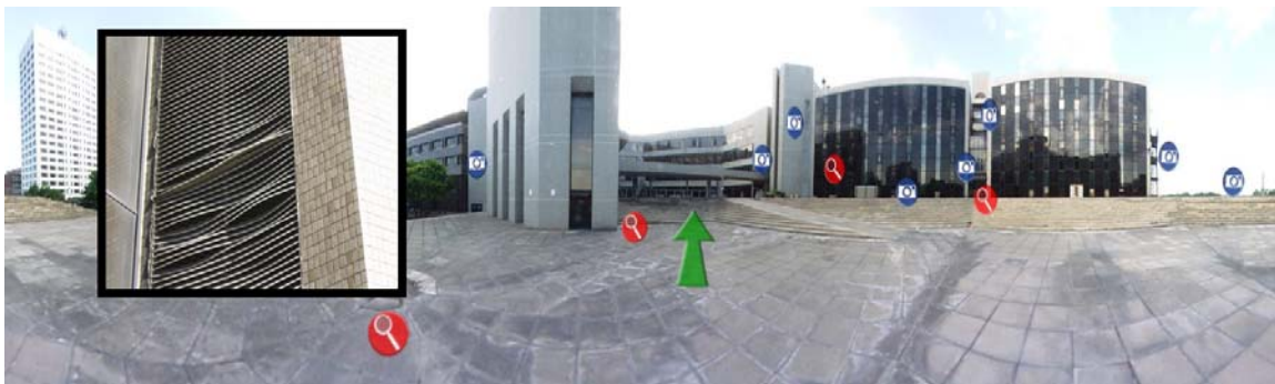
FIGURE 3: QuickTime VR panorama

IPIX is also acknowledged as being one of the sector's leading providers of digital panoramic virtual reality photography software (VRP, 2005), produces excellent results and would have lent itself to this type of application. However IPIX is normally preferred for large volume work. An annual license fee to use the software inflates the costs for low-end users and precluded its use on this project.