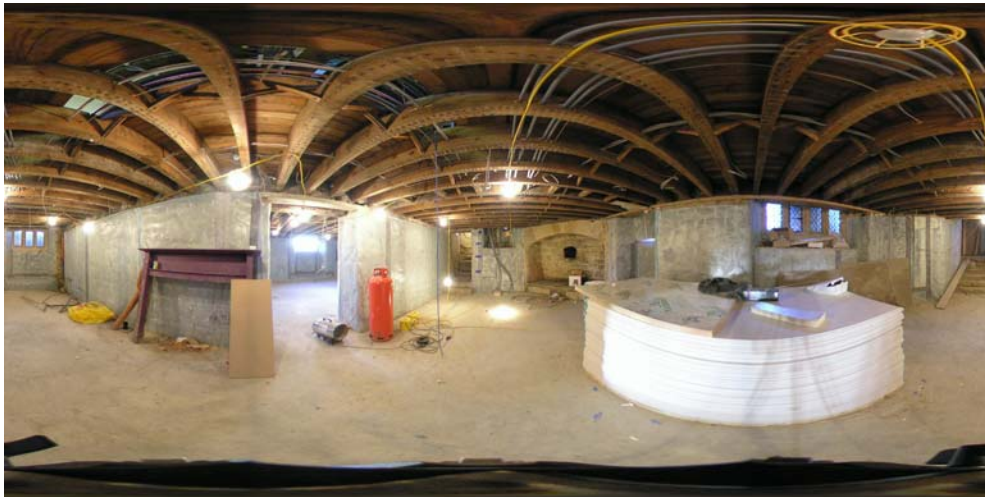
FIGURE 5: 360 degree scene created from 2 fisheye images

Tourweaver software was found to possess many features that lent itself to the proposed building pathology application, namely an interactive map with compass effect and customised walkthrough (EasyPano, 2006). Students can navigate via a floor plan, a series of hotspots embedded within the virtual tour or thumbnails. Not only did the compass highlight the direction in which the user was travelling but it also showed the field of view – as the user zoomed in to see a particular construction defect, so the field of view narrowed. Moreover, the application could accommodate several floor plans, presented either within one skin or on a number of different screens.