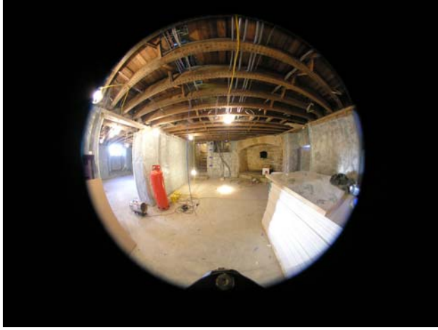
FIGURE 4: Fisheye image of the building interior

A Nikon Coolpix 8400 8MB digital camera with Nikon FCE9 183 degree fisheye convertor, positioned on an Agnos M rotator head screwed to a regular tripod pan head, were trialled – the rotator enabling an accurate through 180 degrees. Software settings allow adjustment of the centre X, Y co-ordinates and the radius size to ensure a good stitch before the image is published as a .jpg file (see Fig. 5).