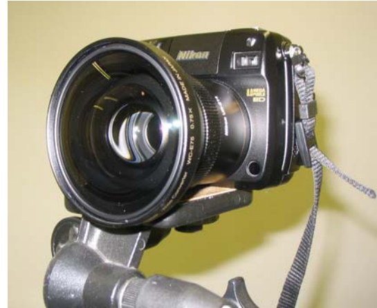
FIGURE 2: Fisheye converter