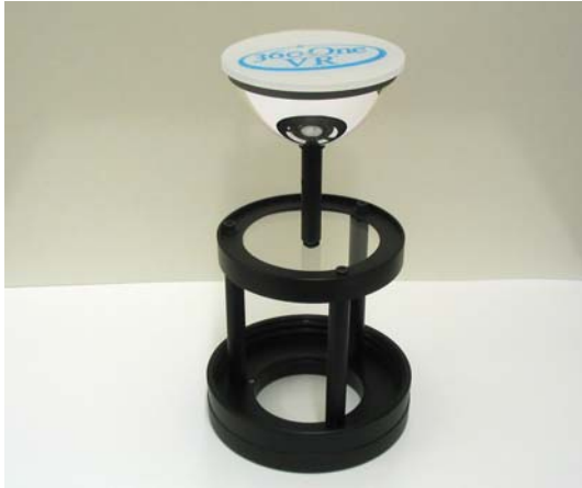
FIGURE 1: Kaidan 360 One VR Optic