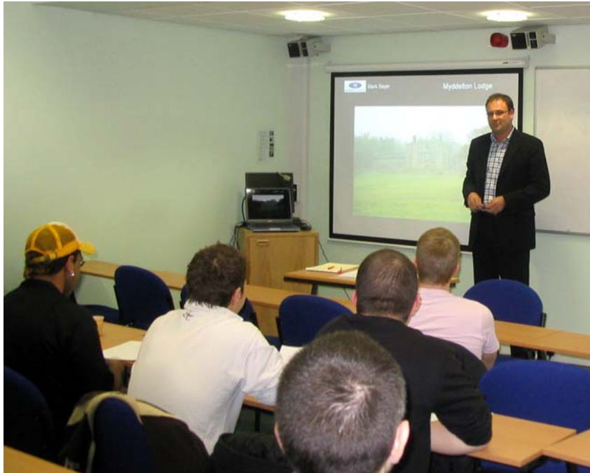
FIGURE 7: Virtual tours embedded within PowerPoint presentations

is understandable that they might initially be sceptical or indeed cynical about the motivations for developing such materials. Maximum benefit, it is suggested, will be gained by using VR materials in a holistic teaching and learning approach which values existing approaches. Aspen and Helm (2004) argue that this mix or blend of approaches can be of considerable benefit to students, leading to effective engagement in a range of situations.