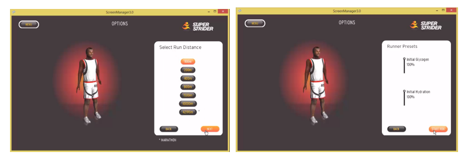
Fig. 1. Configuration of the Virtual Runner at startup. Left: selecting the distance. Right: choosing initial levels of glycogen and hydration.

The game is designed as a single-person game, in which the player has to control the running speed of the sole game character, the Virtual Runner , to obtain fastest running times at given distances. The achieved running times are kept in a scoreboard, and several users on the same computer can run the game by keeping individual profiles in the software.