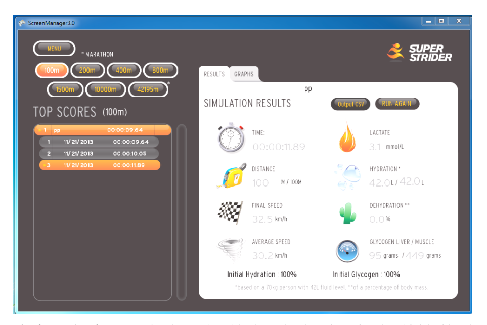
Fig. 3. Results after a completed run. The table shows levels and running data (right). Also the top scores for the specific running distance are shown (left).

After the run has been completed, the screen shows the final state of the simulation with the levels of lactate, glycogen and hydration. In addition, the running time is shown as well as average speed and final speed (Fig. 3). The user then can see graphical plots of these data over time or distance (Fig. 4).