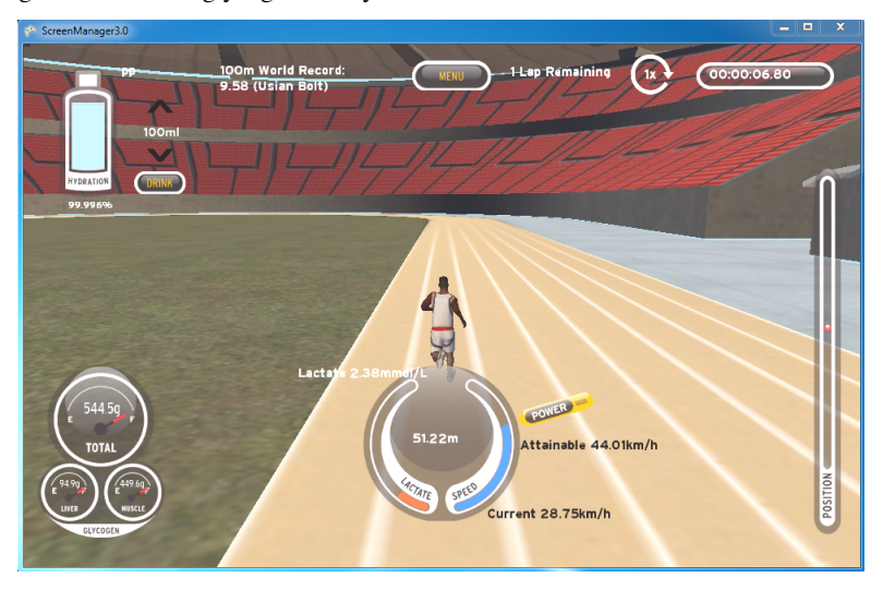
Fig. 2. The main 3D running view of the game. The central widget shows lactate level and speed, and the yellow lever on the centre-right side can be moved with the mouse to control the runner's speed.