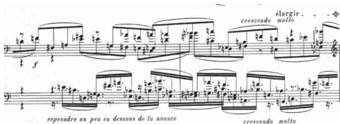
Example 5. Pierre Boulez, Second Sonata for Piano , from second movement.

Let us look at an example which raises the issue of how one interprets notated beaming, and the implications in terms of metre.