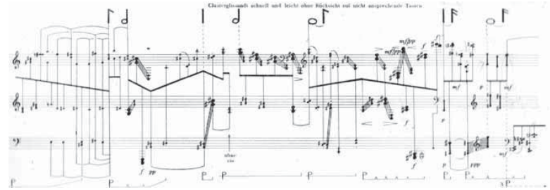
Example 14. Stockhausen, Klavierstück X , p. 2, second system.

effect as the group approaches its conclusion (this effect is also produced by the particular dynamics and pitches employed).