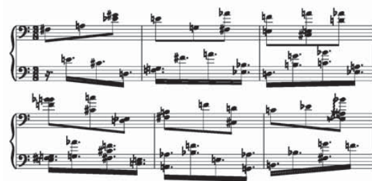
Example 6. Re-notation of passage in Example 5.

regular pulse that would result from the version I wrote out, and which I hear in Pollini's performance. It demands some imagination from the performer to clarify this defamiliarisation of what would otherwise be a regular pattern (and would as such serve an overly cathartic function in the context of what is otherwise a high degree of metrical irregularity). One way to do this is to put a slight stress on the first of each beamed group of four, and play the last of such groups a little less than the other notes, combined with an ultra-legato touch in both hands to emphasise the connectedness of notes within a group.