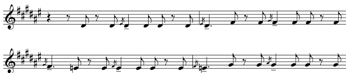
Fig. 9. Liszt, Mephisto Waltz No. 3, as often played.

In performances and recordings, almost invariably I hear pianists pedal the quavers with grace notes, especially those at the beginnings of bars (as well as top-voicing the passage). The variety of duration thus produced then makes it more akin to a melodic line (Fig. 9).