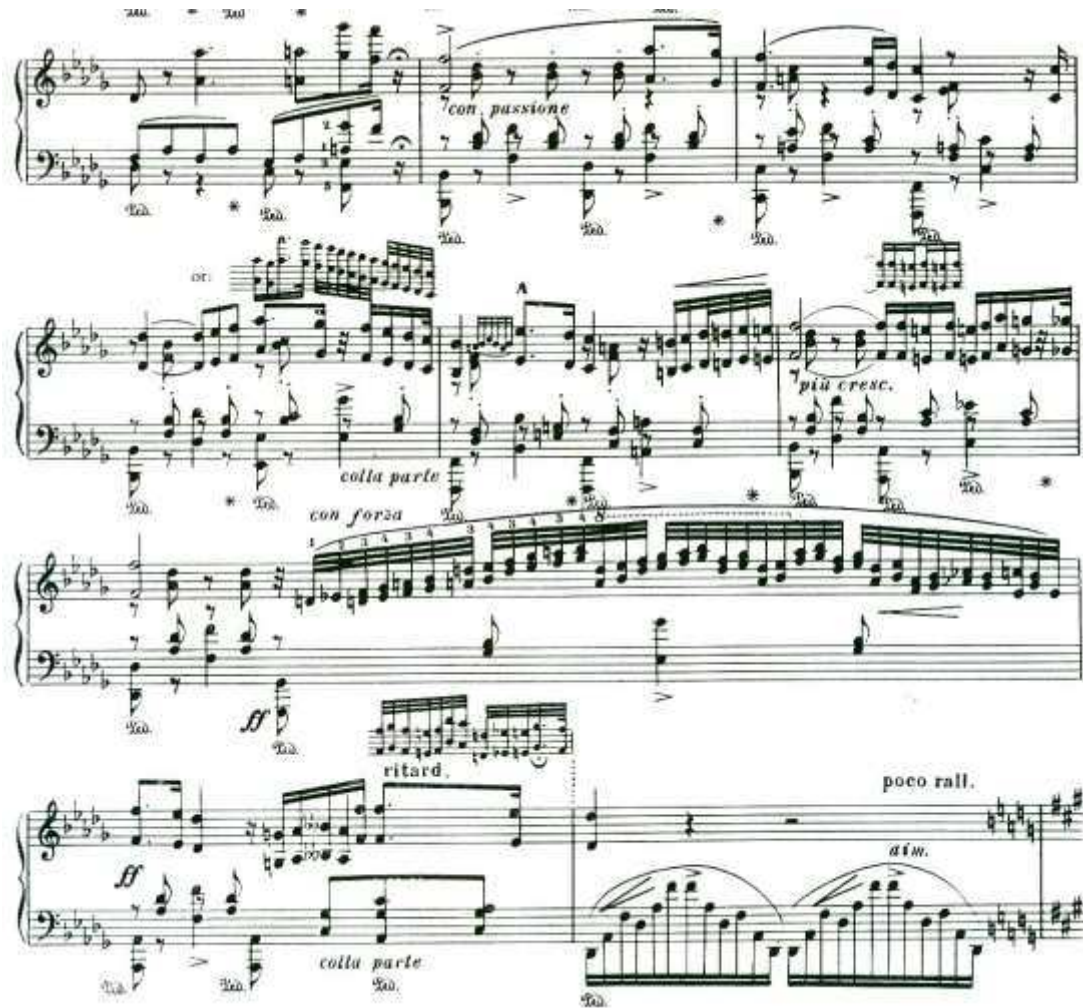
Fig. 11. Liszt, Grand Concert Fantasy from Sonnambula (Bellini).

But I wonder if a passage like this (or corresponding writing in the Réminiscences de Lucrezia Borgia , overloaded to the point of being almost comical) was really meant in a somewhat tongue-in-cheek fashion? And if so, how sincerely are the sentiment and passion to be put across in performance? Can the very overstatement of them give an ironic, parodistic quality to the music, or might one consider playing with a degree of knowing detachment?