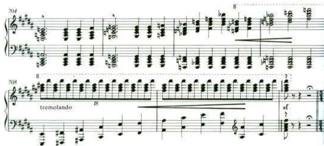
Fig. 5. Liszt, Sonata in B minor, bars 704-710.

The ‘slow movement’ provides some repose from all this, using sustained sonorities continuously, rightly through to the final return of the ‘damped timpani strokes’ (bar 453). But the high degree of edgy staccato writing in the fugue counteracts this, once again acting as a textural/articulative counterpart, only here the contrast is more on the macroscopic level. And so it continues, up to the wrenched sf that cuts short the final appearance of the ‘Grandioso’ theme (Fig. 5).