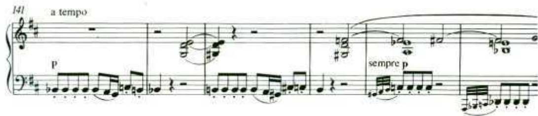
Fig. 2 Liszt, Sonata in B minor, bars 141-146.

Throughout the whole of the Sonata, sustained legato melodic lines are countered by their opposite, sinister staccato utterances, creating an extended conflict between the two types of material. A passage like Fig. 2 shows this process clearly.