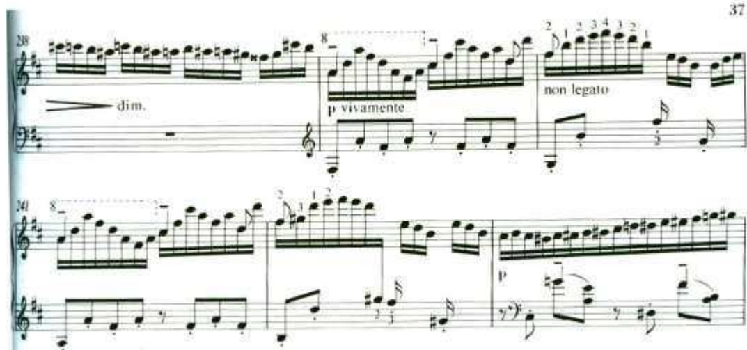
Fig. 7. Liszt, Sonata in B minor, bars 238-243.

This is the sort of effect that a colouristically-minded player like Horowitz performed exceptionally (for example in his recording of Vallée d'Obermann ), by which what would otherwise be simply decorative figuration comes to the foreground, as if threatening to engulf the basic line, thus causing another level of dramatic tension. In this and other moments of the Sonata, what might otherwise become a somewhat banal continual re-statement of the basic thematic material is presented in such a way that the configuration is almost more important than the material to which it is being applied. And an interpretative approach that stresses continuity of line and long-range harmony above all else can fail to capture this quality of excess which is to me such a fascinating aspect of Liszt's music.