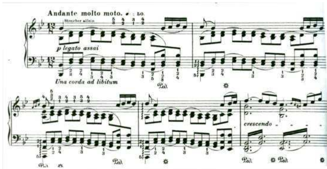
Fig. 15. Beethoven-Liszt, Symphony No. 6, “Pastoral”, opening of second movement.