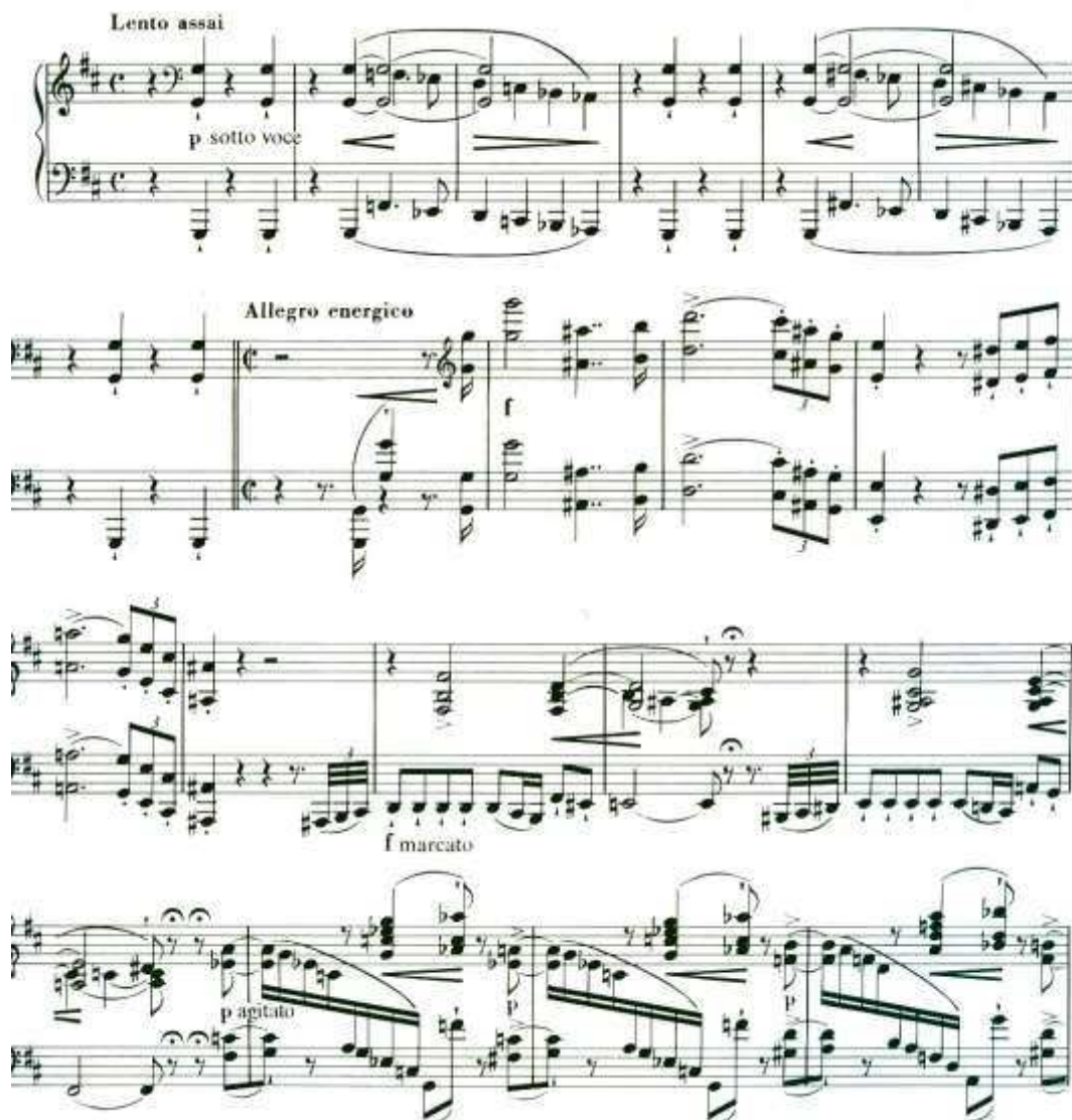
Fig. 1. Liszt Sonata in B minor, opening.

and very rhythmically, but not too fast, at \text{minim} = 72^{29} . Liszt also draws a comparison with Beethoven's Coriolanus Overture , in which terse staccato chords in the orchestra alternate with sustained unisons.