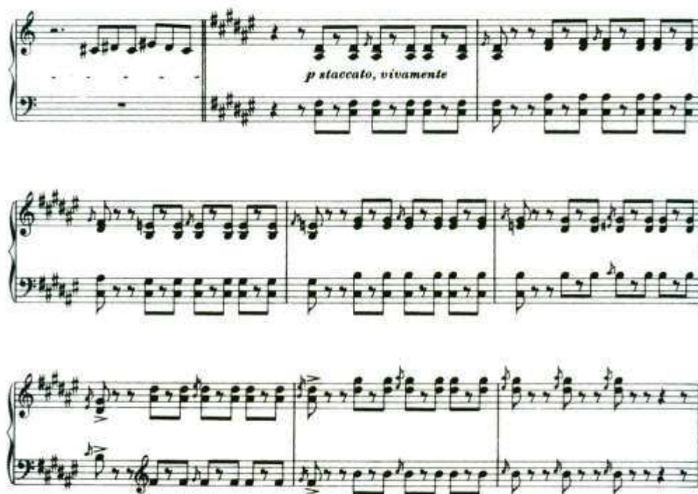
Fig. 8. Liszt, Mephisto Waltz No. 3.

I feel the temptation to ‘humanise’ this piece, softening its edges, can counteract such a possibility. Fig. 8 shows the first appearance of the staccato figures which come to accompany the espressivo theme.