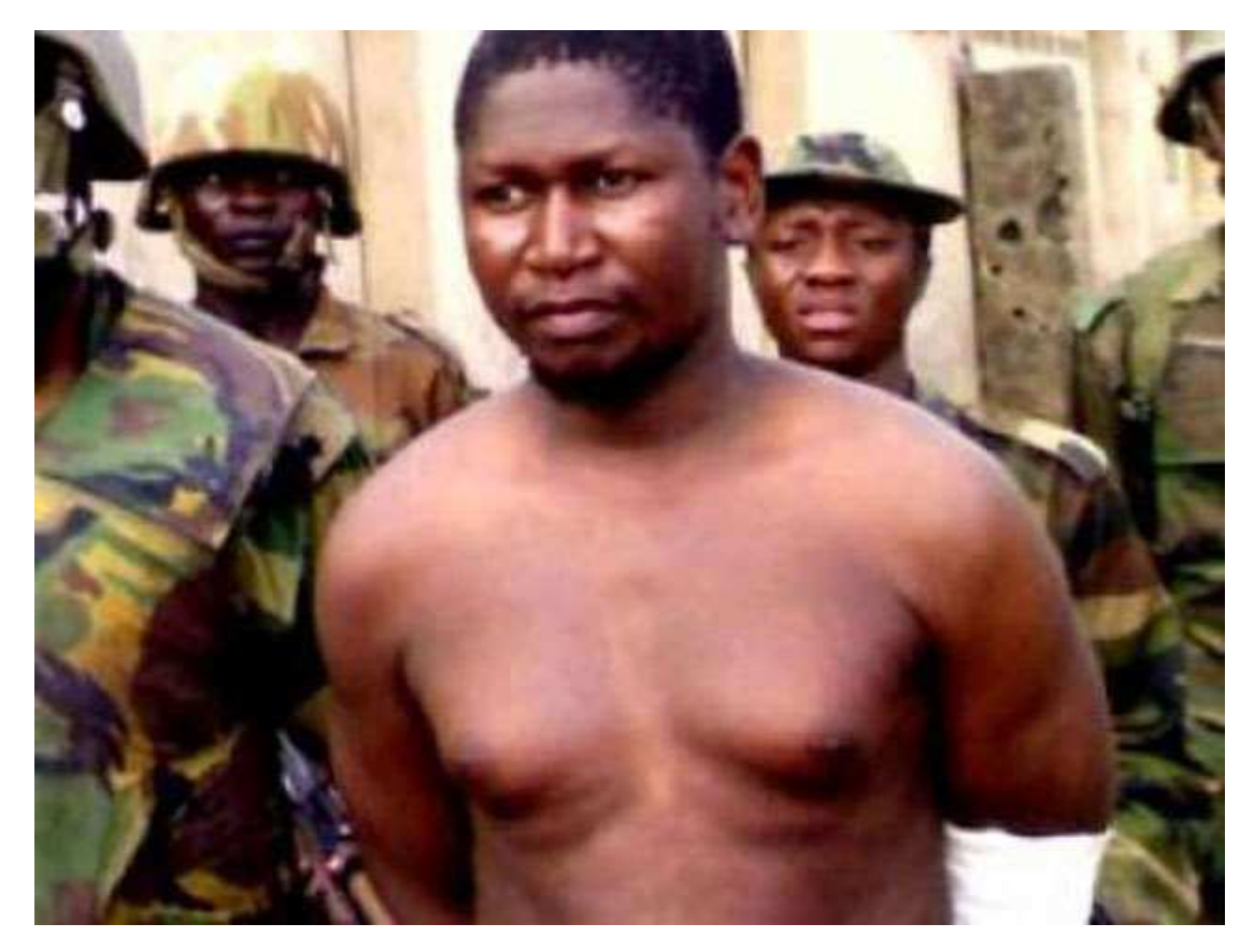
Muhammed Yusuf's arrest: Ex-leader of Boko Haram Muhammed Yusuf at the time of his arrest by the army in July 2009. The photo was uploaded in the Internet apparently by Boko Haram members or sympathizers (photo), <a href="http://www.leadership.ng/nga/sites/default/files/articleimages/mohammed_yusuf_.ipg">http://www.leadership.ng/nga/sites/default/files/articleimages/mohammed_yusuf_.ipg</a>, accessed 29 January 2012.)