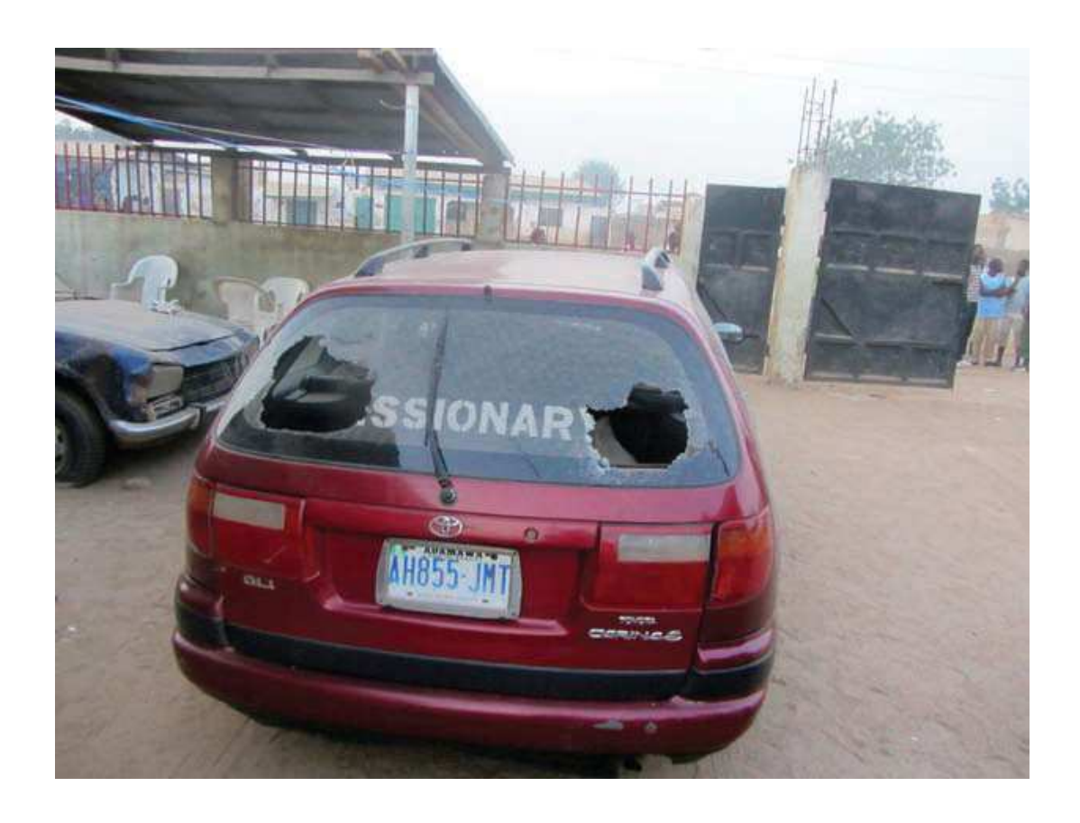
Bullet holes in 'Missionary car': Damaged missionary car after the attack on a church in Yola by suspected Boko Haram members in January 2012.