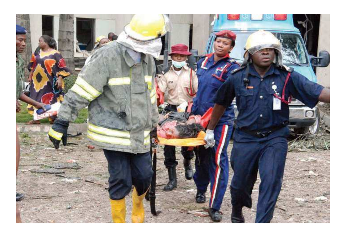
Removing the victims: Rescue workers removing the victims of the car bomb attack on UN building in Abuja in August 2011 (photo by Felix Onigbinde).