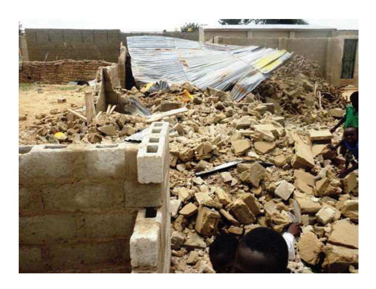
Rubbles: A house turned into rubbles following a raid by operatives of the joint military task force in response to a blast that targeted their vehicle.