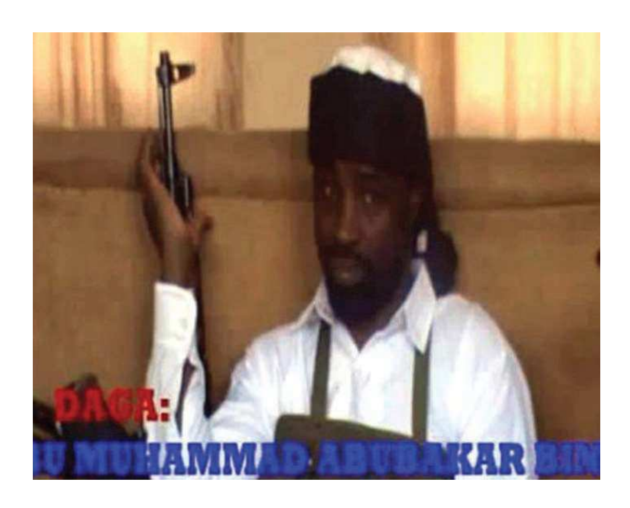
Abubakar Shekau, the current leader of Boko Haram who has replaced its founder Muhammed Yusuf (photo), http://www.google.co.uk/imgres?q=abubakar+shekau&um, accessed 30 January 2012.