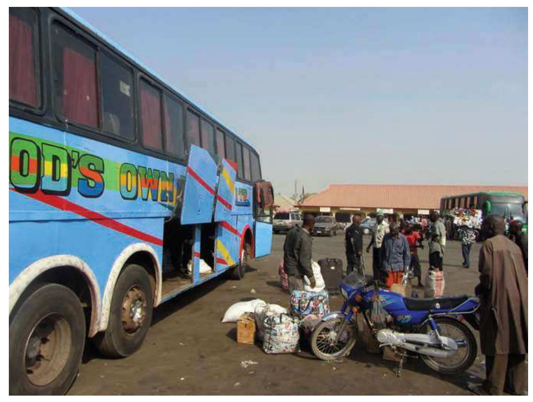
Southerners preparing to leave: A group of southerners at Yola Motor Park hoping to travel home after attacks on churches by suspected Boko Haram members in January 2012.