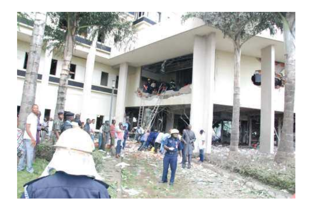
Bombed UN building: United Nations office in Abuja after the car bomb attack in August 2012. Boko Haram's spokesman Abul Qaqa claims that the group was responsible for the attack.