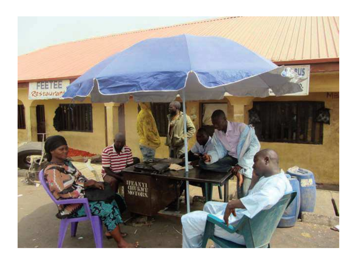
Coach booking shed: A small shed at Yola Motor Park (coach station) in Adamawa State, north-eastern Nigeria, where passengers buy tickets to travel to south-eastern Nigeria.