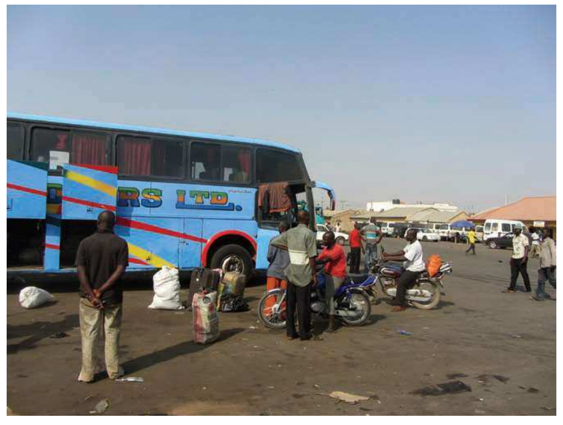
Motor Park in Yola: People trickling in hoping to get a vehicle that can transport them to south-eastern Nigeria.