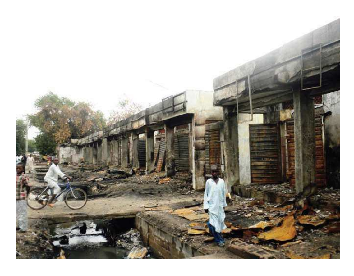
Burnt properties: Houses and shops burnt by operatives of the joint military task force (JTF) at Budun area of Maiduguri. The area was suspected to be a stronghold of Boko Haram.