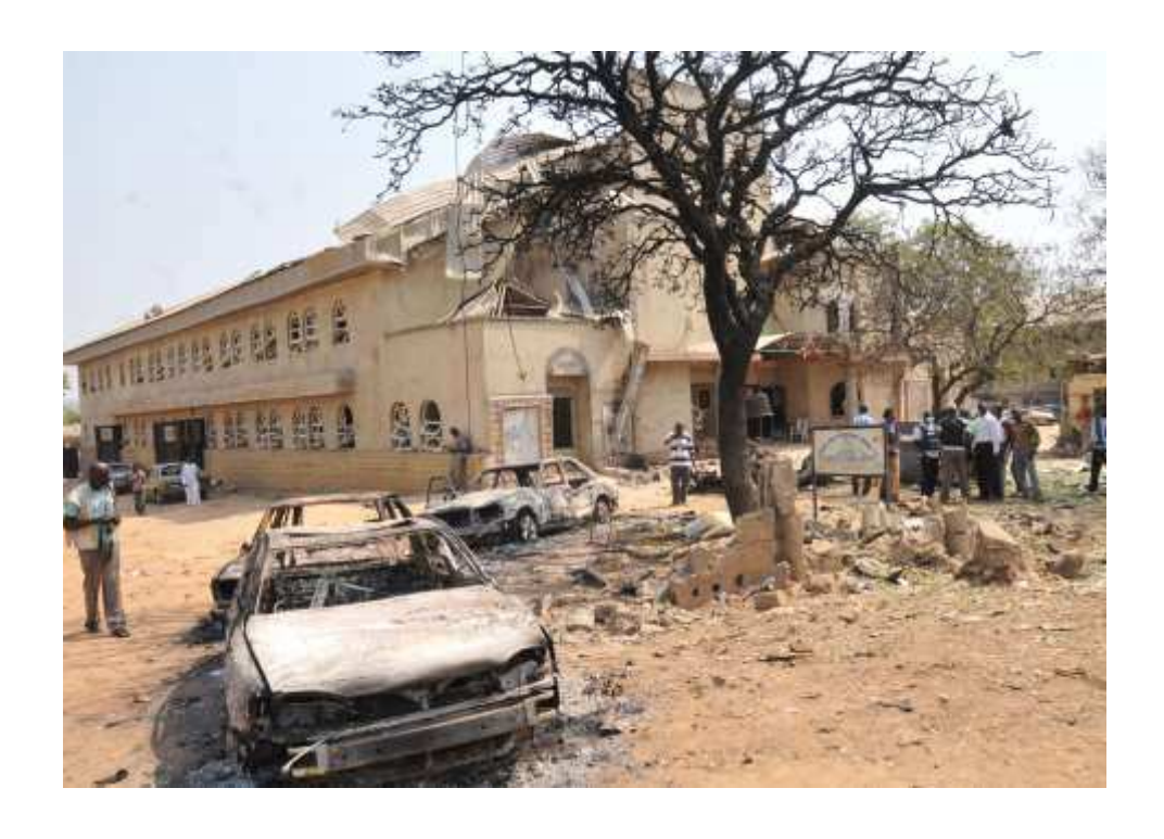
Catholic Church: St Theresa Catholic Church in Madalla, near Abuja, after the Christmas Day bombing in December 2011 blamed on Boko Haram.