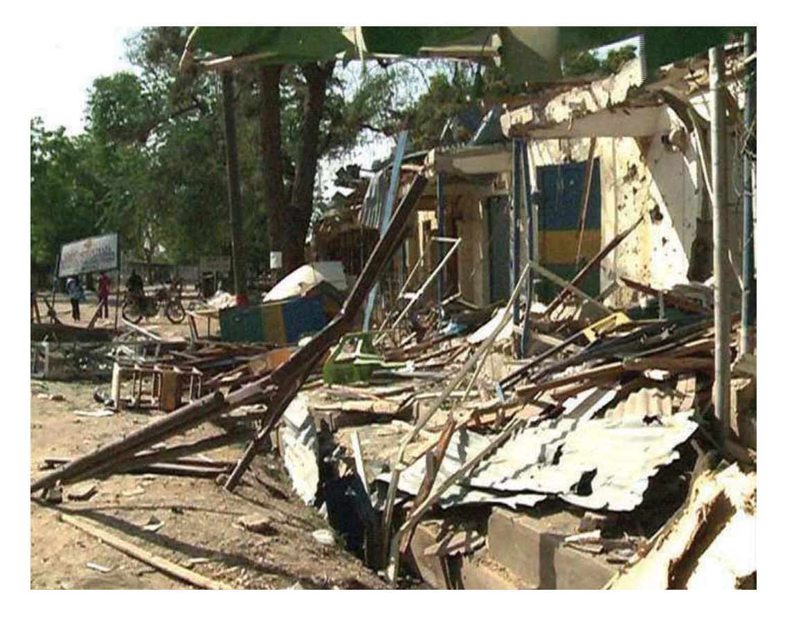
Bombed police shops in Kano: The ruins of police shops bombed in January 2012 by suspected Boko Haram members in Kano, northern Nigeria.