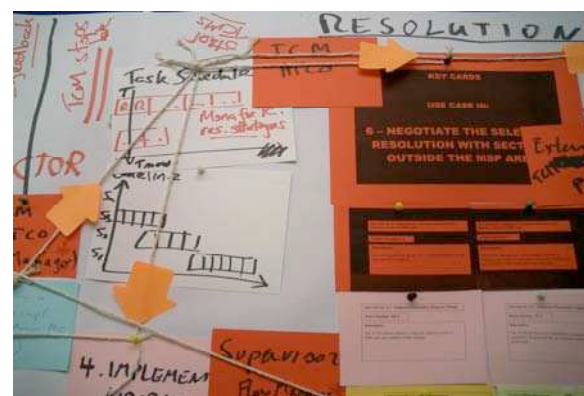
Figure 9. A section of the rich storyboard for the MSP system.

A close-up of part of one storyboard, shown in Figure 4, demonstrates its richness. It shows, on the right-hand side, actions as part of a use case for negotiating air space use outside of MSP areas and the actor who will undertake these actions – the traffic complexity manager controller (TCM ATCO). The left-hand side shows 2 visualisations of traffic flow complexity that the controller will use to undertake these actions. Strings annotated with direction arrows indicate temporal and information flow dependencies on use cases and actions elsewhere in the storyboard, and other actors such as the flow manager supervisor. After the workshop, the MSP team revised the structured use case descriptions in light of the third workshop results.