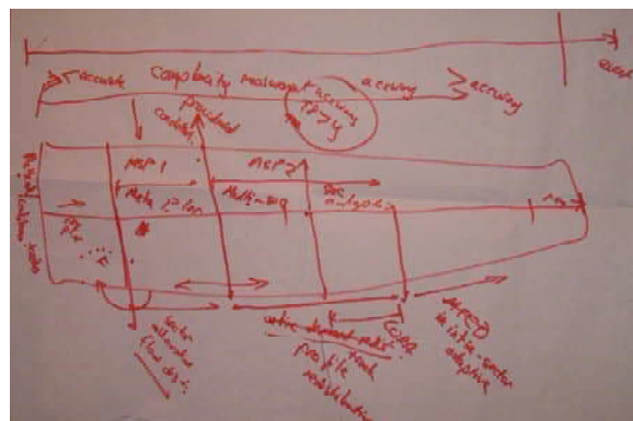
Figure 2. A timeline model of the MSP developed to combine existing MSP ideas.

During the second workshop stakeholders were encouraged to combine existing ideas documented on the ideas card directly using some simple rules. They were motivated to do so by listening to a short presentation on fusion cooking by one of the facilitators. In the subsequent group work the 3 groups only generated 4 new ideas.