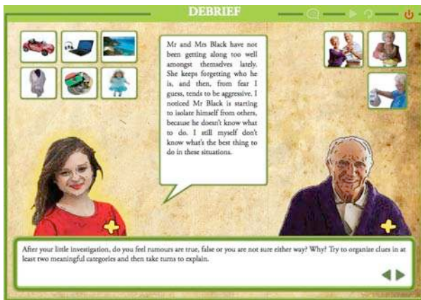
Figure 5 – The interactive whiteboard provides an overview of the clues players collected in the game, and a set of creativity triggers for random combinations and brainstorming.

Each step of this stage is supported using physical materials such as flipcharts and post-it notes as well as the interactive whiteboard and its contents.