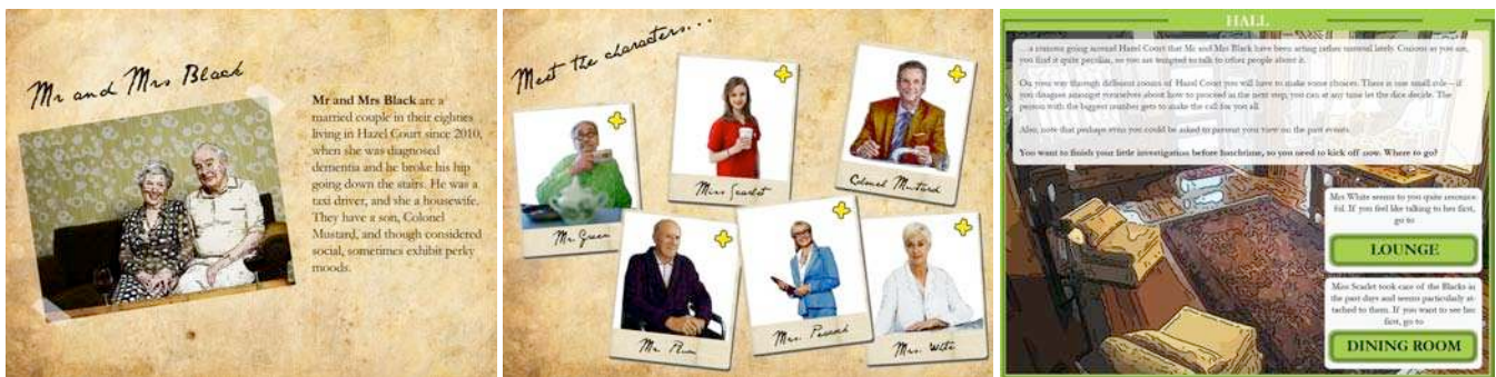
Figure 4 – Different images from the Hazel Court serious game: (a) the introduction to Mr and Mrs Black; (b) player selection of each character to roll-play in the game, and; (c) the entrance hall in which the game begins

The game was designed to support 2-6 players and last for 30-45 minutes, but in this version a human game master was added to facilitate the game. The players again investigated the unusual behavior of the Blacks during the same 3-stage game as in the paper-based version. The digital app provides the players with instructions to play the game, introduces the Blacks as shown in Figure 4a, then describes the characters shown in Figure 4b for the players to role-play. These characters include Miss Scarlet as a less-experienced carer, Mrs Peacock as the head nurse and Mr Green is a fellow resident and Blacks’ good friend. The players then enter the hall of Hazel Court where the game begins, as shown in Figure 4c.