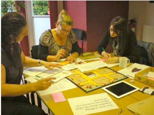
Figure 3 – Carers playtesting the Hazel Court paper prototype, showing use of the Cluedo board and paper clues. The iPad was only present to audio-record the game play

Some of the players were unclear about the purpose of the second part of the game – the mini-task of searching for objects in the physical space – indicating a need to link both the objects and the searching for them more closely to the storyline of the game. The need for greater facilitation also emerged. For example, the combinational creativity task in the third part of the game was not effective without clearer, more integrated facilitation of the technique and explicit creativity prompts.