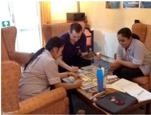
Figure 2 - An early first playtest investigated whether the posing of detective-style mysteries as a game mechanic as a form of the other worlds creativity technique could be at all effective in dementia care training.

Moreover the game was designed to be a pervasive game, which turns the environment into a playable space that is controlled by the players rather than the technologies [2, 41]. As such, it was not restricted to the board or the computer, but involved spaces and objects in the environment in which the game is played, thereby connecting the playing of the game more closely to the care environment and the use of other training techniques in it.