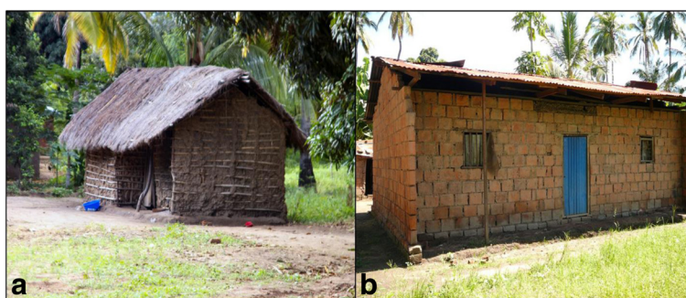
Figure 2 Representative house types commonly available in Idete and Namwawala villages. A temporary house (a) and a permanent house (b).

The analysis was performed using generalized linear models (GLM) (MATLAB R2012a, Poisson distribution, 95% confidence interval) to assess the impact of each