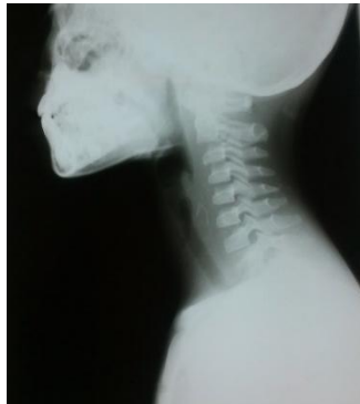
Figure 5. Second neck x-ray before to operation room showing the thickness at retropharynx and opaque appearance (suspect a fish bone) as high as C5-6

could open the mouth widely. On throat examination there was no protude of posterior pharyngeal wall. Before take to the operation room, neck x-ray was repeated (figure 5).