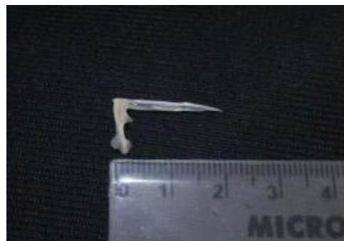
Figure 6. A Fish Bone

detected. At right neck region: the swelling was decreased, no fluctuative. Therapy was continued.