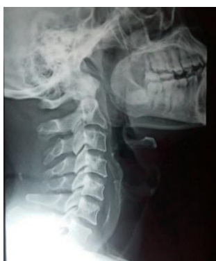
Figure 1. Lateral Neck x-ray show radioopaque foreign body appearance as high as C6 with mild thickness at retrolarynx soft tissue

On lateral neck x-ray, there was opaque foreign body appearance elongated at soft tissue retrolarynx as high as C6. There was mild thickness (18 mm) at retrolarynx (figure 1).