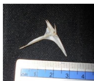
Figure 2. A fish bone

Laboratory examination was in normal limit. On ECG and thorax x-ray there was no abnormality was detected. Esophagoscopy using rigid esophagoscope was done under general anesthesia. A fish bone (figure 2) was successfully remove from esophageal introitus (17 cm from incisivus teeth).