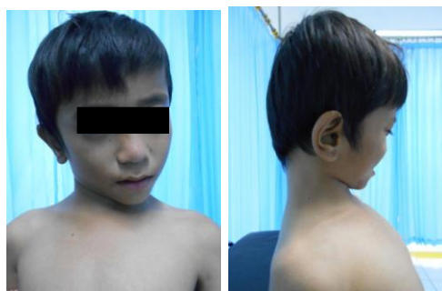
Figure 3. Picture of the patient showing torticollis

On physical examination general condition was moderately ill, compositis cooperative, blood pressure 110/70 mm Hg, heart rate 90 x/1 min, respiratory rate 20 x/min, temperature 38°C. On ear and nose examination there was no abnormality was detected. On oral cavity examination there was trismus 1 cm, throat could not be evaluated. On neck examination there was neck stiffness, torticollis and there was swelling at the right side, solid, tenderness, no fluctuative (figure 3).