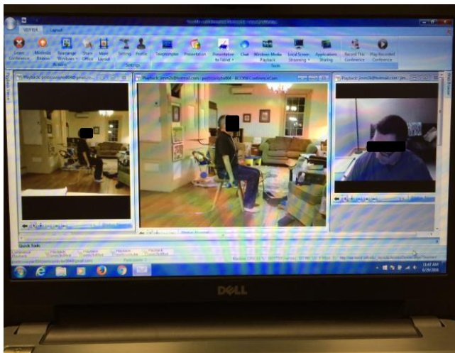
Figure 1. A sample screenshot of an exercise session delivered via VISYTER.