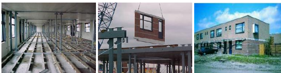
Figure 3. A+ Floor and Building System

For example a building system that results in the fact that the materials used in a dwelling construction project in the Netherlands, weigh about 50% of comparable traditionally built houses of the same volume, which is about 70 ton less weight (Lichtenberg, 2005). The parts of the whole building are prefabricated and assembled on site on top of a light foundation. The main structure is composed of steel columns. The flooring system is composed of steel beams (normally IPE 160, for 5m span) embedded in a thin concrete layer which meets the requirements for strength and stiffness. Conducts and cables for the service installations are prefabricated as well and placed within the flooring system that is finished with thin flooring panels. These include hatches that can be opened to change or maintain the conducts and cables. The main structure is covered with prefab façade elements which are composed of masonry outside walls including the window frames, insulation and a concrete inner wall. On top a complete prefabricated roof is placed. Finally the inside partitions and vertical conduct system is placed. The assembly of the main structure of 36 houses took 3 weeks, while all houses were delivered within 5 months after the start of the construction (Deelen, 2001).