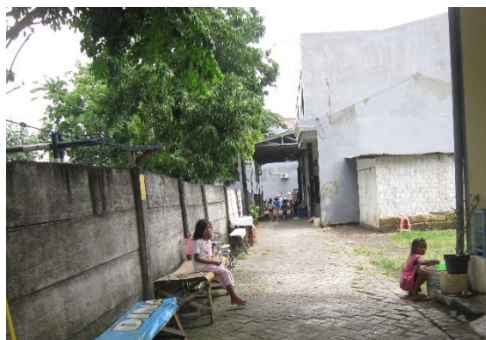
Figure 4. Wall separator as the limit of children's playground

In-depth interviews were also conducted to the heads of neighborhood; IT WAS FOUND THAT NOT ALL locals wanted the wall to be demolished for security reasons. The motorcycle theft incident several TIMES WHEN IT IS LIMITED BY THE WALL. DURING THIS TIME THE THIEF ALLEGEDLY JUMPED FROM BEHIND THE WALL IN AN ATTEMPT TO ESCAPE. BESIDES, THE WALLS make SOME RESIDENTS FEEL ABLE TO SUPERVISE THEIR CHILDREN IN PLAY EASILY BECAUSE THE CUSTODY HAS A CLEAR LIMIT, NOT TO PLAY UPON THE OUTER WALL. BUT the desire not to dismantle the wall is still inferior to the wishes of local residents who have interests for the accessibility/park of the car. During this time, people who have a car can not easily pass because there is a small 'congestion' in the housing. So through the joint consultation between residents of GunungAnyar JAYA UTARA DETERMINED THAT THE WALL IS BETTER DISMANTLED BECAUSE IF THE WALL IS DEMOLISHED, IT WILL BE AVAILABLE SPACE OF APPROXIMATELY 2 METERS THAT CAN BE USED ANYTHING RELATED TO THE OPEN SPACE.