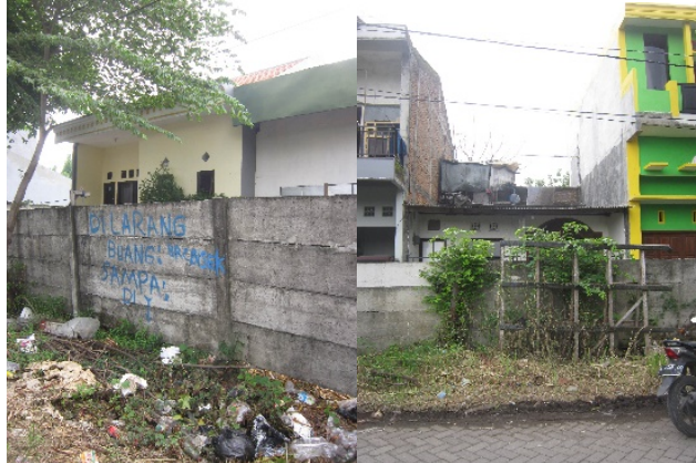
Figure 3. Warning not to throw garbage on walls area of GunungAnyar Jaya Utara