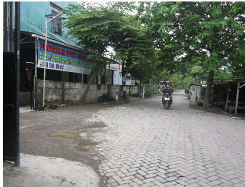
Figure 1. Separation wall on the housing of GunungAnyar Jaya Utara

observation, the main concern is the separation wall between Wigunaroad with GunungAnyar Jaya Utara housing.