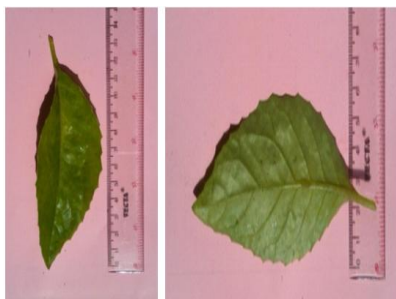
Figure 1. Sambung Nyawa leaves

Raw materials were collected from the University Farming at Mangunan, Yogyakarta, Indonesia based on our previous study of high quality of dried materials after comparison to other locations in Yogyakarta and surrounding (Figure 1). Collection was taken at once to limit variation due to different sampling condition.