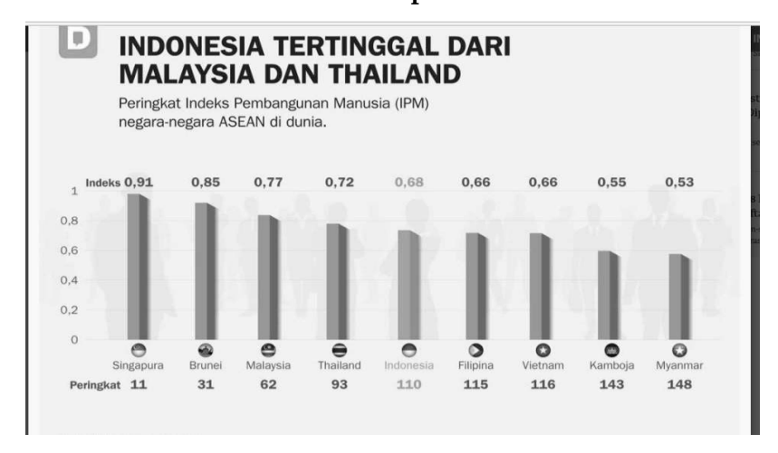
Chart 1. Human Development Index 2015