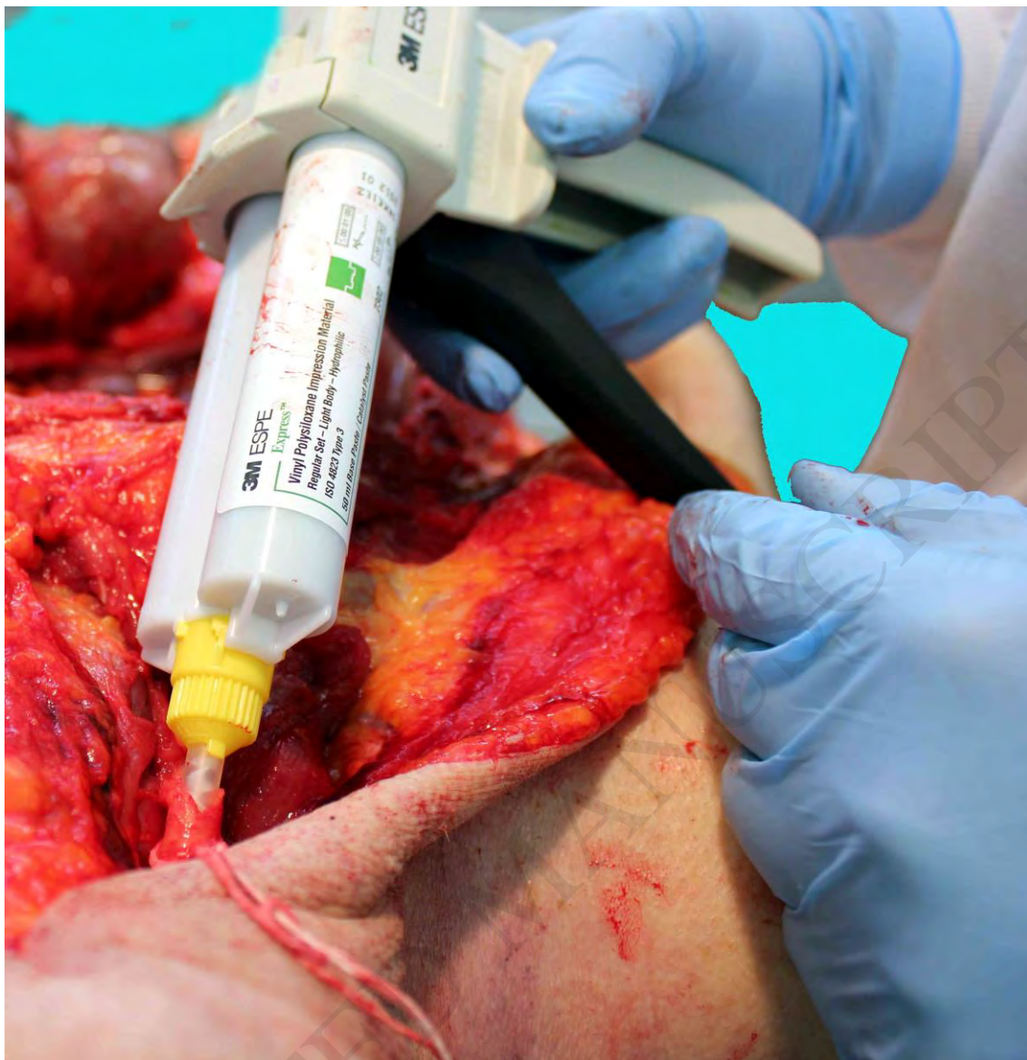
Fig. 4: Brain extraction with already solidified arteries