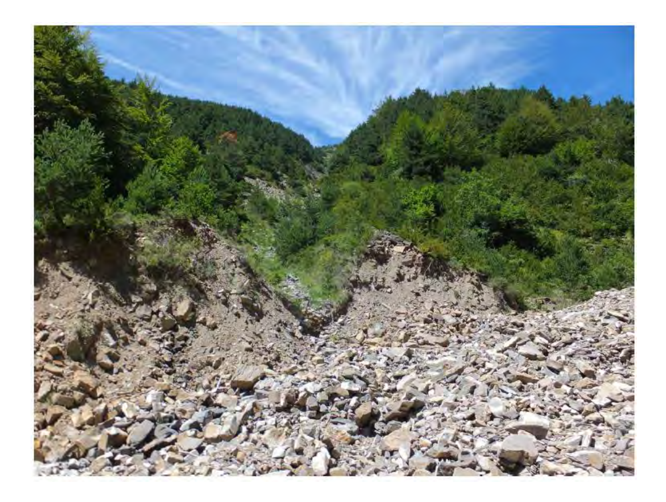
Figure 9. In many cases, the decline of soil erosion on the hillslopes because of plant recovery activates incision in the main rivers. In such case, sediment yield at the river outlet does not represent geomorphic activity on the hillslopes; thus, estimation of high sediment yield has limited value. The picture shows recent incision of the Ijuez River, Central-Western Pyrenees, following afforestation on the slopes, leaving the tributaries disconnected. The height at which the tributary is perched is approximately 1 m.