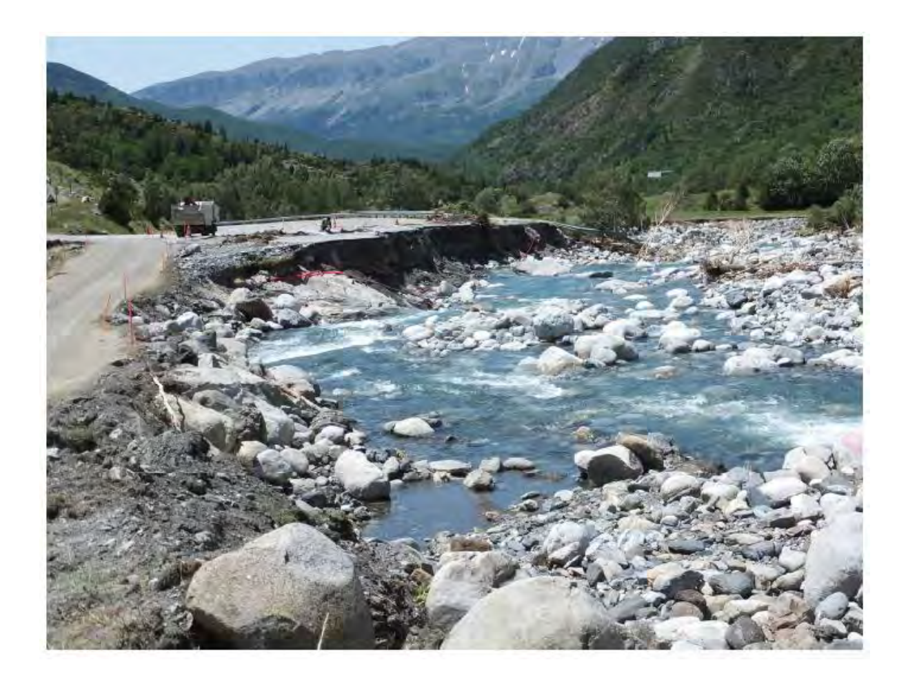
Figure 4. Riverbanks are one of the most relevant sediment sources, particularly during floods, although their role in sediment yield and sediment budget estimates is generally undervalued. Can riverbank erosion be considered as relevant as hillslope erosion within a catchment? This is a critical question that lacks a clear answer. The Ésera River, Central Pyrenees, immediately after an extreme flood event: June, 2013.