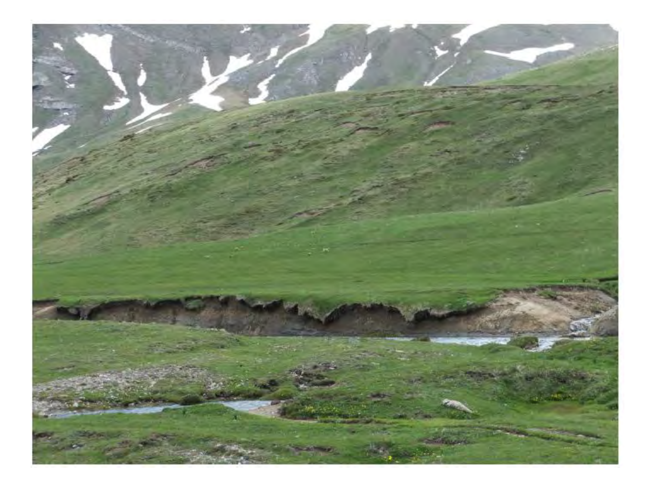
Figure 5. Erosion processes on hillslopes are not always directly related to sediment yield at the outlet of the main river. This picture shows that steep slopes are intensively affected by landslides, although they are disconnected from the valley bottom and the stream. Nevertheless, the stream can erode the sediments in the valley bottom during relatively high flows. In such case, sediment outputs are not related to erosion processes on the hillslopes. Plandániz, Hecho Valley, Central-Western Pyrenees, July 2014. Fluvial incision is 2 m high.