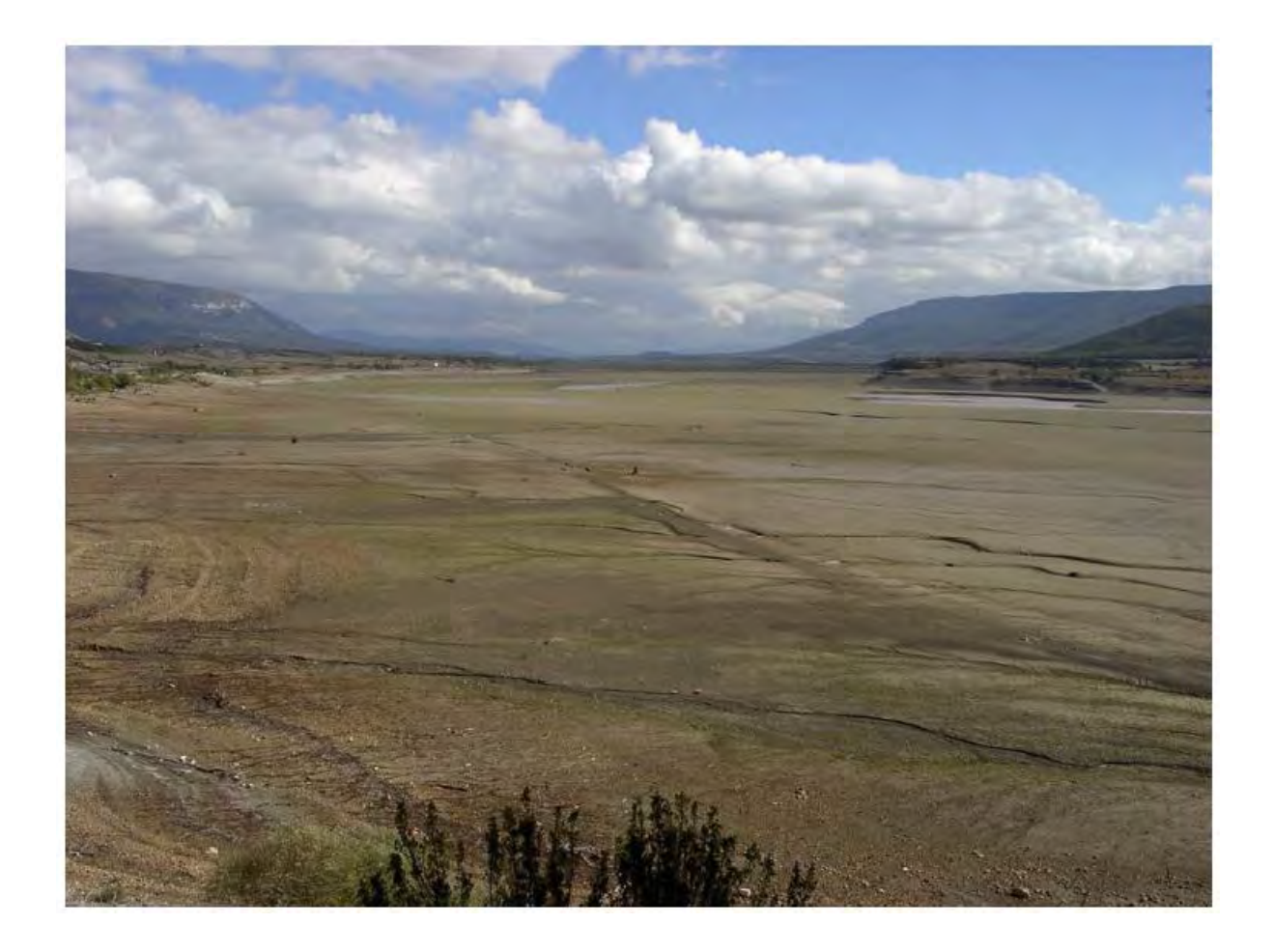
Figure 7. Reservoir siltation is one of the most important off-site effects of erosion, because of the high environmental, economic and social costs of reservoir construction. In most cases, the removal of sediment from reservoirs is not considered for economic and technical reasons, resulting in the disablement of highly expensive infrastructures over decades. The Yesa Reservoir, Upper Aragón River Basin, at the end of September 2011, showing sediment accumulation.