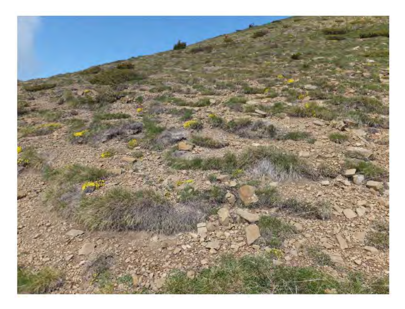
Figure 8. The spatial organization of plant cover interacts with geomorphic processes, overland flow and infiltration, conditioning sediment yield, runoff generation and connectivity. Gelifluction terracettes in the Aragüés Valley, Central-Western Pyrenees, July 2014. The height of the steps between terracettes is approximately 20-25 cm.