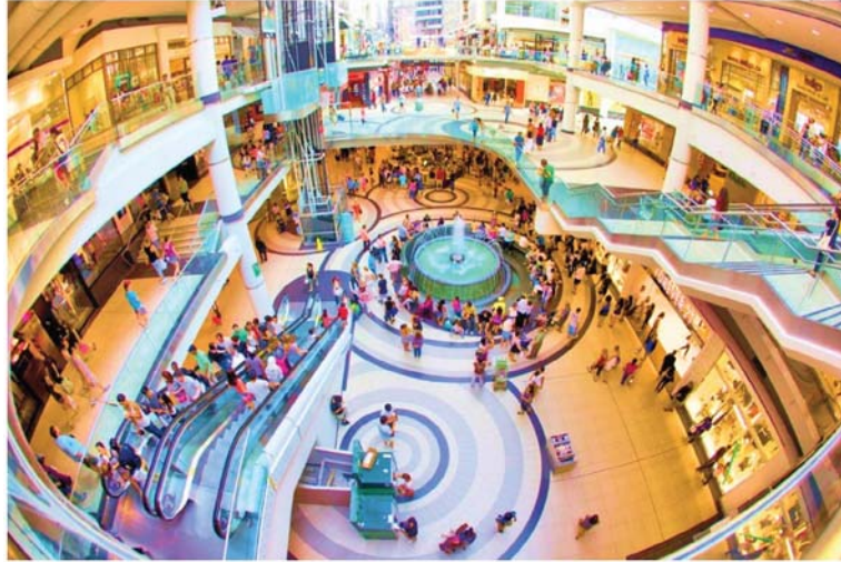
Figure A1. Exciting mall atmosphere.