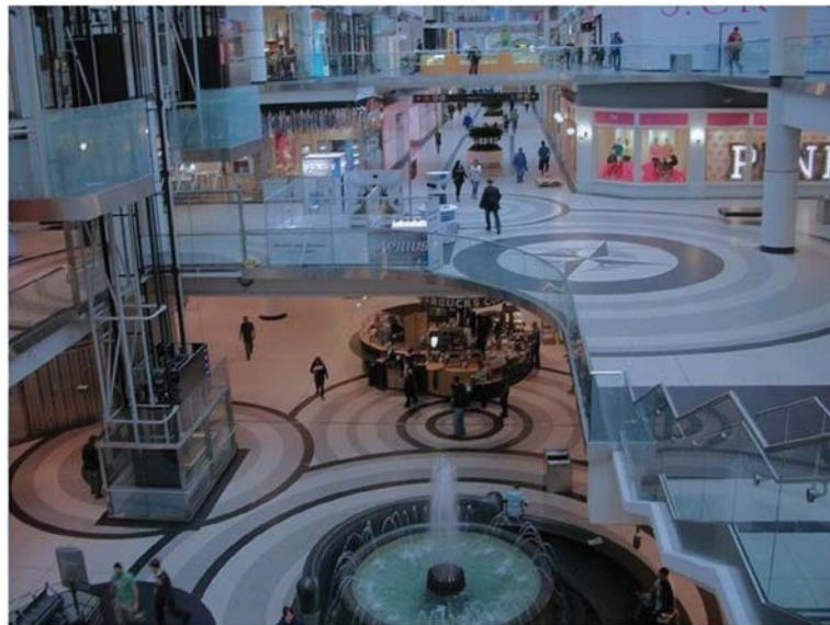
Figure A2. Non-exciting mall atmosphere.