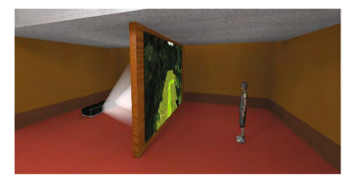
Fig. 4. Testing room for the large stereo screen condition.