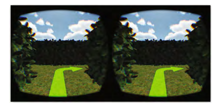
Fig. 2. View of the Maze with the Oculus Rift.