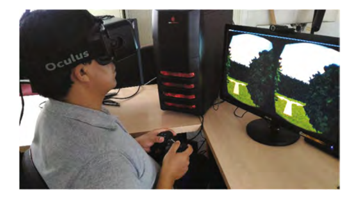
Fig. 3. A participant carrying out the task with the gamepad.