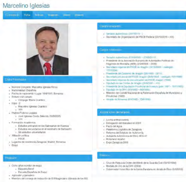
Fig. 4. An example of an infobox obtained by the NEREA system.