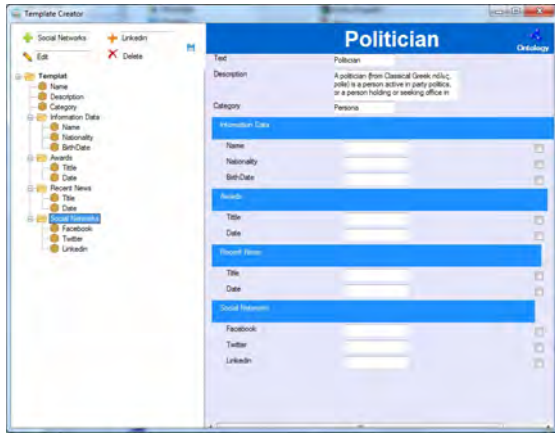
Fig. 2. Screenshot of the template managing software of NEREA.

data source is the local knowledge base, although the system extracts information from other global KBs like DBpedia. In that way, we enhance our local information and improve the KB that supports the system.