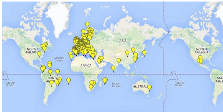
Fig. 2. Map of existing LL according to ENoLL Web Site [20]

Referring to LL as an organization, many European cities have established their own ones for developing new initiatives. The European organization that brings together most of this LL is the European Network of Living Labs (ENoLL) [26], which was legally established as an international association in 2.010, and it has developed since then all kind of initiatives for spreading its aims, methods and objectives.