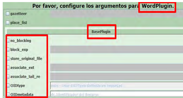
Fig. 2. Lack of detail on format configuration panel