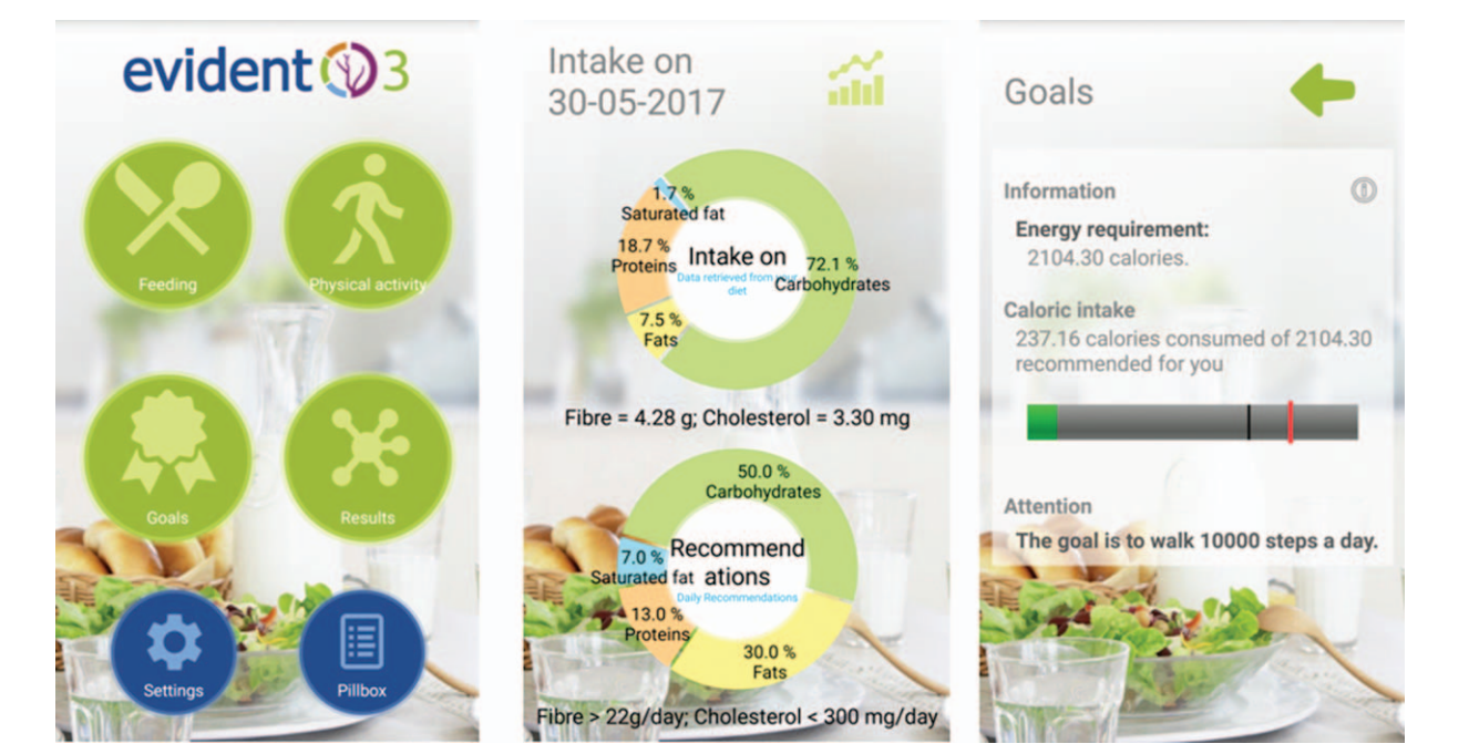
Figure 2. Screenshots of the EVIDENT 3 application.

2.8.1. General analysis. Results will be expressed as mean \pm standard deviation for quantitative variables normally distributed or medians (interquartile ranges) for the skewed variables and by frequency distribution for qualitative variables. The statistical normality will be tested using the Kolmogorov–Smirnov test. The Chi-square test and Fisher exact test will be used to analyze the association between independent qualitative variables. The Student's t test or Mann–Whitney U test will be used for the comparison of means between 2 independent groups. Pearson