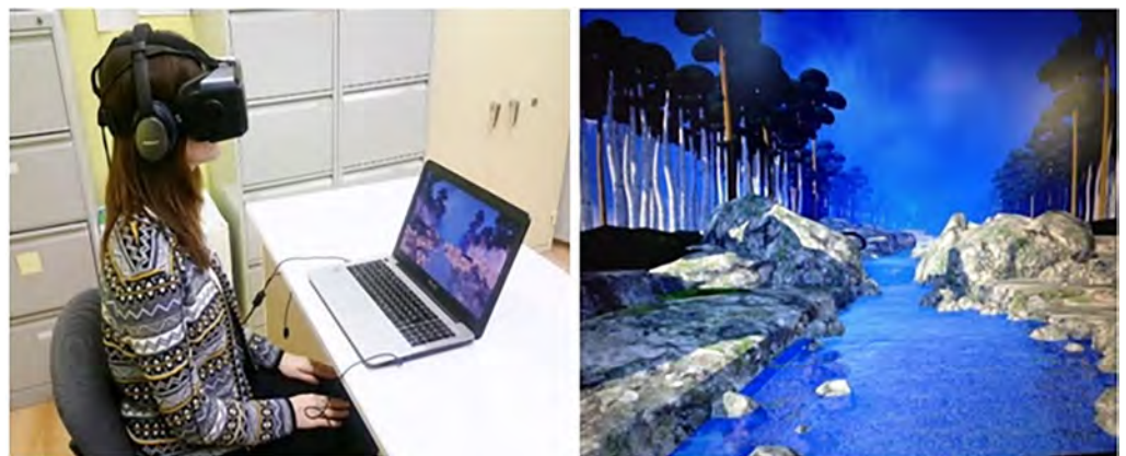
Fig 1. Image on left. 3rd International Mindfulness Congress' participant testing Virtual Reality DBT mindfulness skills training. Image on right. A screenshot of the Virtual Reality world the participant watched through Oculus Rift DK2 VR goggles while listening to Dr. Linehan's DBT® Mindfulness Skills™ audios ( http://behavioraltech.org ). Note: The individual in this manuscript has given written informed consent (as outlined in PLOS consent form) to publish these case details.

Participants look into the VR goggles, and they see computer-generated images. What they see in VR changes depending on which direction they are looking. The virtual world hardware and software are designed to give the participant the illusion that they are "there" in the computer generated world. Using head tracking technology, participants view of the virtual world changes in real time, as they move their head orientation/look around. For example, the person starts out looking straight down a river in virtual reality.