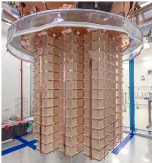
Figure 3. Side view of the 19 CUORE towers deployed in the cryostat.