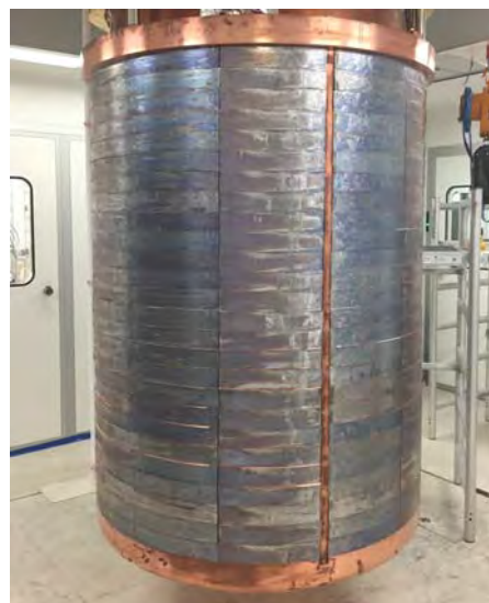
Figure 4. Roman Lead lateral shield, which surrounds the towers.

(CUORE Upgrade with Particle IDentification) group of interest has formed, in order to coordinate R&D efforts towards the goal of increasing the sensitivity on T_{0\nu} [9]. Different approaches are presently investigated, using different isotopes and sensors as well as exploring the viability of enriching ^{130}\text{Te} . Strong R&D efforts are currently being made to investigate the different techniques. The goal of CUPID is to probe the entire inverted hierarchy region, with a sensitivity on T_{0\nu} of 2 - 5 \cdot 10^{27}\text{y} with 10 years of data, with a corresponding limit on m_{\beta\beta} between 6 and 20 meV [10].