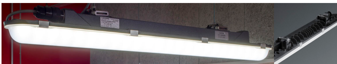
Figure 2. LED luminaire.

Due to its specific composition, the environmental impact of this component, should not be calculated with standard datasets such as “Aluminium, cast alloy {GLO}” or “Aluminium alloy, AlMg3 {RER}”, available in EcoInvent, as it has been demonstrated that the differences in environmental impact are relevant. Table 10 compares the impact with EcoInvent’s proxy and the selected alloy. There is an increase of between 0.158 and 0.179 pts per housing if compared with the AlMg3 alloy; moreover, the environmental impact is up to 127% higher than the standard aluminum cast alloy described by EcoInvent. This is a clear example of the influence of the alloy composition on the environmental impact results.