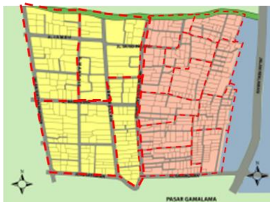
Figure 2. Population Distribution and Sample