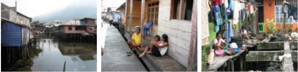
Figure 3. Makassar East Village Neighborhood Conditions, Ternate Districts Central

residents tend to be stressed in the environment and trying to find a place for activities outside the home. Activities outside the home are also limited because of limited access to land. This causes the neighbourhoods become irregular and crowded, so that the quality of the environment is lowered (see Figure 3).