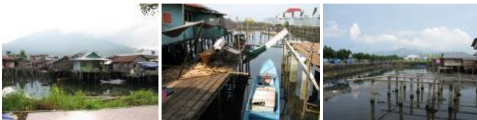
Figure 5. Settlement Layout Overlooking the Sea

Location of settlements is on the coast and above the water, causing the settlement area is highly vulnerable to natural disasters. Natural disaster in question here are disasters caused by climate change found in offshore waters. Strong winds and earthquakes, as well as high waves are potentially large natural catastrophe in coastal areas. To anticipate this, it needs arrangement for residential neighbourhoods to mitigate the disaster (see Figure 5).