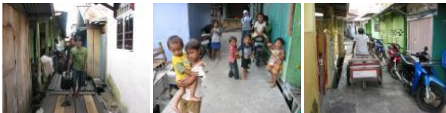
Figure 6. Road Conditions at the Settlement in Kampung Makassar, Ternate