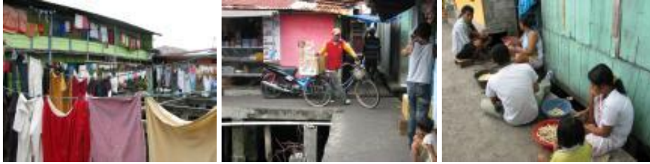
Figure 4. Settlement Patterns at the Community Activity in Water, Urban Village East Makassar, Ternate. Source: field survey, 2011

Environmental degradation caused by the settlement lies in the tidal area. According to the interview results in this neighbourhood, a few years before the inner street was built, the water under the house still look clean because dirt will be swept away and flowed to the sea. In fact, at the beginning of the settlement, water was channelled to houses and can be used to bathe and play, because the water condition was clear and clean. Now the condition is far from expected. Sea water became stagnant, murky and dark, sometimes with unpleasant odours. This condition is further aggravated the condition of neighbourhoods.