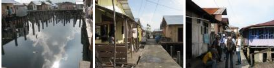
Figure 7. Settlement Arrangements in The Village of East Makassar, Ternate

a variety of skin covering the various buildings. In general, the skin covering the building is plastered brick (90%) and the rest of the boards and glass, the doors and windows. Floor coverings in traditional houses on the coast are still using stucco, while the modern houses on the coast already use ceramics. Roof coverings used mostly zinc and the surface reaches 20% of the overall building shell cover (see Figure 7).