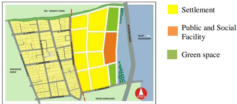
Figure 10. Distribution of land use

closest to the sea. It is intended as a delineation of the area to avoid the expansion of settlements to the sea. This block can be designated as green space as well as social and public facilities. Open space is further defined by Rapuano (1964) in Yuliani (2013) as land with the use of a specific function or quality of its composition performance. Residential building affected by the eviction of the block, moved to another block by constructing multi-stories buildings or houses, to meet the space needs of each family being moved, and so forth until the area is well ordered.