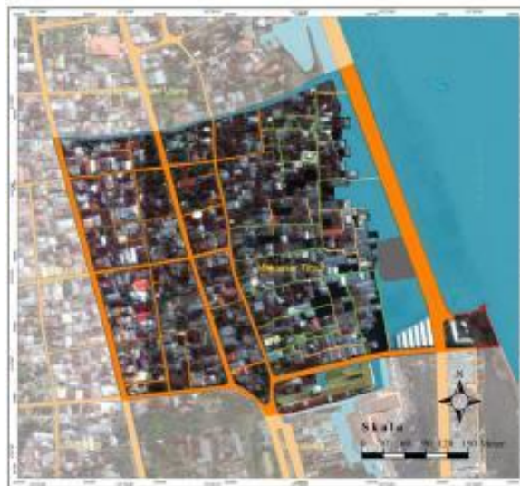
Figure 1. Location Research Village East Makassar, Ternate Districts Central

The populations in this study are all administrative territorial units of housing in the village of East Makassar, Ternate. The samples are set through purposive sampling technique, where houses and settlements are located and built in the land or on the water zone. Sample selection on the water zone was conducted due to the existing settlement pattern is still chaotic and environmental regulation has not been oriented to mitigate disaster. The distribution of the population and the sample can be seen in Figure 2.