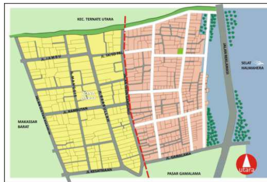
Figure 8. Structuring the Makassar village area on the water

cle. Moreover, to anticipate the impact of fires spreading, grid pattern will allocate the flame only at the burnt block while other blocks will be spared.