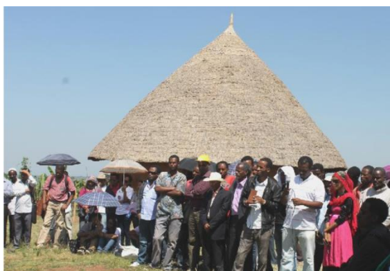
Figure 4. Local People and Dignitaries Attend The Inauguration of SRDU II

In September 2011, a small event was organised whereby each of the trainees received three different-sized metal moulds for block making and an illustrated manual in the local Amharic language which describes the construction process step-by-step. This was to encourage the trainees to begin implementing what they had learnt. It was suggested they try to construct a modest structure in their localities using the SRDU building materials and construction techniques. At this early stage emphasis was not put in replicating the SRDU in its totality, but rather consolidating what had already been learnt. The response of the trainees was encouraging: within a period of six months, four trainees managed to produce hundreds of soil blocks while one of them constructed an outdoor toilet using the SRDU technique. This was the first milestone in the process of scaling-up and it indicated that the trainees had taken the idea of the research seriously and were committed to taking it forward.