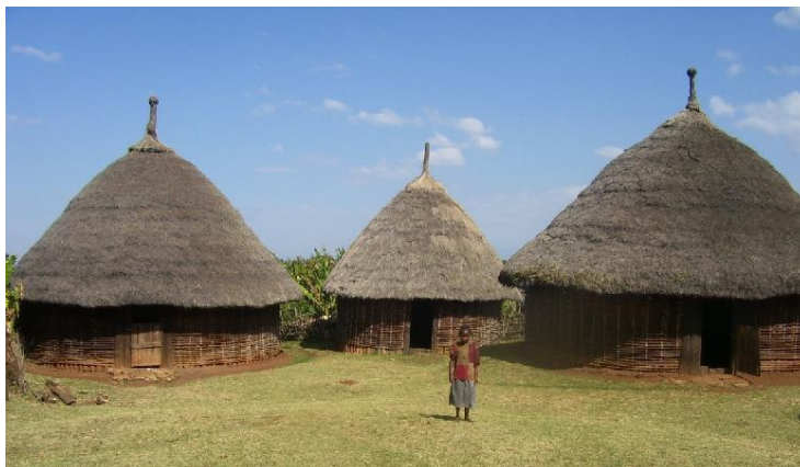
Figure 1. A Traditional Guraghe Homestead with Three Buildings

The research seeks to draw lessons from the vernacular Guraghe architecture and incorporate it into improved rural housing, with a focus on capacity building through hands-on training through the construction of prototype units (see Figure 1). The typical Guraghe traditional house consists of a single room built of wood and mud walls with a straw roof. Those who can afford to will usually build separate houses for livestock and guests, otherwise, the one-roomed dwelling accommodates both animals and humans, only sometimes separated by a wooden partition. The space has a small window or sometimes no window at all and as a result is dark and lacks ventilation. The smoke from the hearth, although important to control insects, has a negative impact on the health of the habitants, particularly the eyes and lungs. Despite these disadvantages, the Guraghe vernacular house boasts a sturdy construction and unique character.