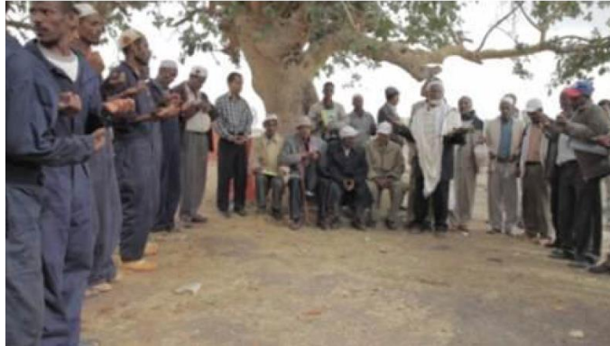
Figure 5. Community Elders Blessing The Project and The Workers

texts indicates the value of working with rather than for communities, and echoes John Turner's early ideas of housing BY rather than FOR people (Turner, 1972, 1976).