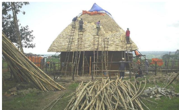
Figure 3. Skilled Craftsmen Fixing The Outer Bamboo Layer Over The Woven Bamboo Roof

A range of materials were tested including sun-dried soil blocks which were found to have sufficient compressive strength for the walls, and woven bamboo was proposed for the roof (see Figure 3). The umbrella type central pole was maintained for strong cultural reasons. To enhance the lateral stability and earthquake resistance of the building; bamboo studs were introduced to connect the foundation with the walls.