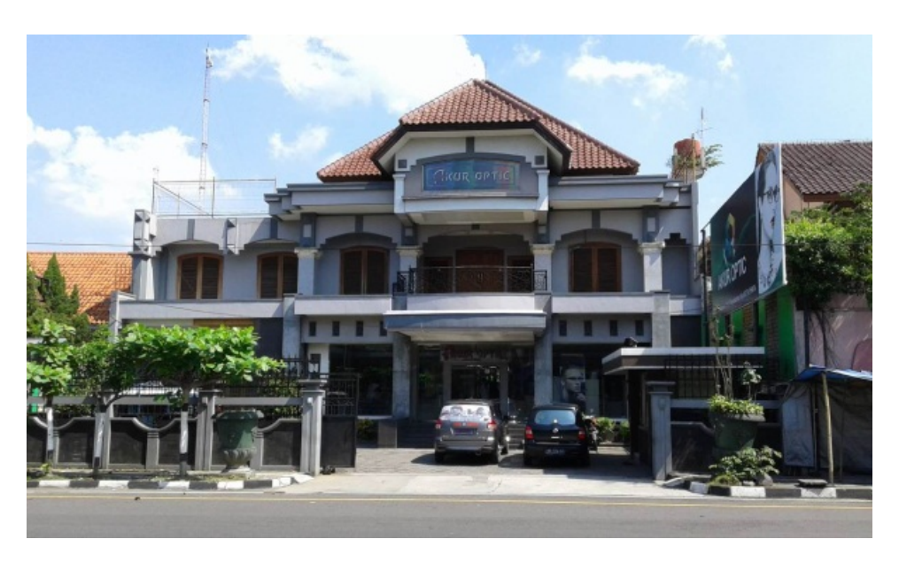
Figure 17. A new building which is contextual to its surrounding