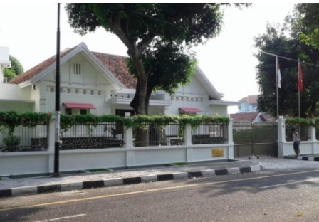
Figure 14. The old buildings which still keep the original appearances and functions Source: Survey, 2017