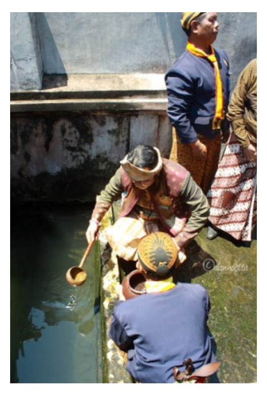
Figure 13. Symbolism of nawu sendang

In Kotagede, people still preserve and do rituals and traditons. Among several traditions, there are "Ambengan Ageng Kotagede" and "Nawu Sendang Selirang" which involve the whole community in Kotagede. "Ambengan Ageng Kotagede" (Picture 12) is a procession which has the aim to alms the crops and traditional foods arranged forming a cone. The alms is prepared by the people to celebrate Islamic religious holidays such as Eid al-Fitr and Eid al-Adha or the village celebration such as cleaning-up the bathing place called nawu Sendang Selirang. There is a procession of Ambengan Ageng from the yard of Jagalan sub-district, passes through Mondorakan Street, surrounds the market, into the yard of The Great Mosque of Mataram. In front of the prosession of Ambengan Ageng, there are miniature of houses with green wall. Inside of those miniature, there are scoops which are made from coconut shell called 'siwur'. These scoops are used for cleaning-up 'sendang' symbolically in the ritual of nawu sendang. After the ritual is done, foods and vegetables inside Ambengan were taken by the people there. Then, they clean-up the bathing place -called sendang selirang- and the moat -called jagang-, together with the court servants.