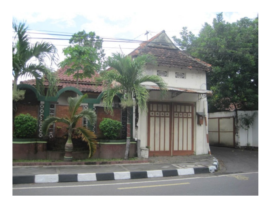
Figure 10. Kalang House in Kotagede, Yogyakarta Source: Survey, 2017