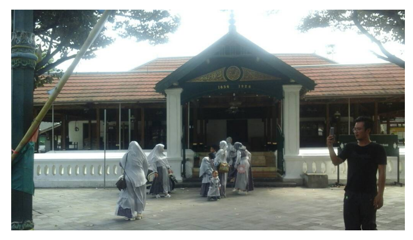
Figure 6. The Great Mosque, Kotagede, Yogyakarta

Dinas Kebudayaan Provinsi Daerah Istimewa Yogyakarta (2009) mentions that the architecture of this mosque adopts Hindu and Buddhist elements. The Great Mosque is also called Masjid Mataram, located at west side of Kampung Alun-alun. This mosque is a sacred place for the Islamic Mataram Kingdom. Its location is integrated with the tomb of the founder of the Old Islamic Mataram Kingdom which is called Pasareyan Agung Kotagede. The area has significant religious and spiritual values. The mosque is a symbol of Islamic influence in hinterland area of Java which was dominated by Hinduism and native beliefs. The Great Mosque as a royal mosque is signified by "mustaka" which is the characteristic of "masjid keprabon". Hinduism character is reflected in the gate and the fences surrounds (Figure 7). The elements of water which surrounded the mosque is the continuation of Hinduism.