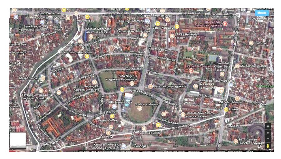
Figure 5. Radial concentric pattern of street in Kotabaru sub-district, Yogyakarta

Kotabaru was the residential area of Dutch officials. In colonial era, this region was specifically inhabited by the Dutch. Today, sub-district of Kotabaru is located in Gondokusuman District at northeast side of city center of Yogyakarta (Figure 4). Kotabaru region has potential assets to be developed as tourism destination, including the image of tropical Indisch architecture, boulevard with shady vegetation, public open spaces which have a function as sports stadium, and public buildings such as railway station, hospitals, schools, offices, bakery, cafés, restaurants, stores and shopping center. Figure 5 shows the radial concentric of the street patterns which make the access from one place to another places easier. Identification of three elements of sense of place in Kotagede and Kotabaru