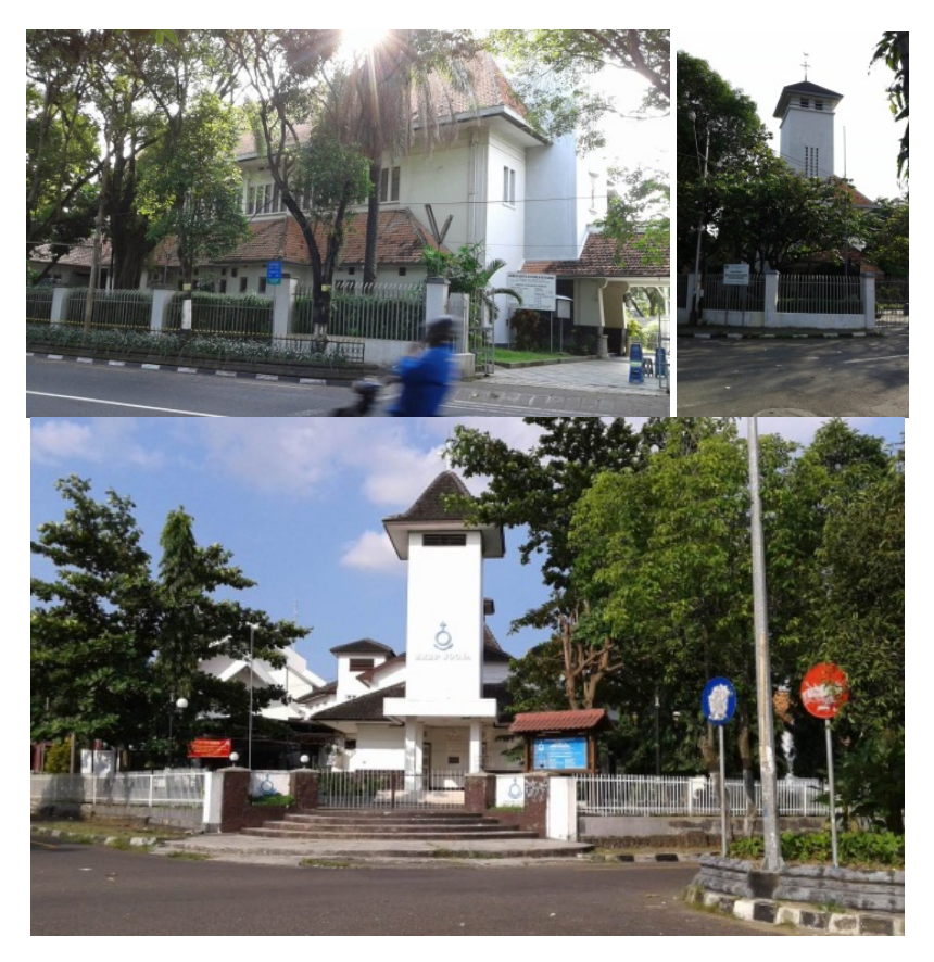
Figure 15. Religious buildings which still maintain their original appearances Source: Survey, 2017