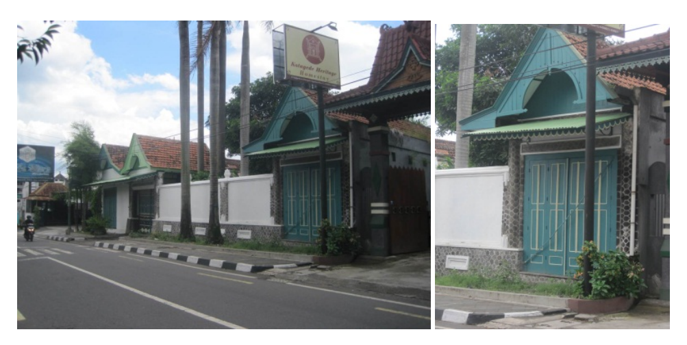
Figure 11. Kalang House in Kotagede, Yogyakarta