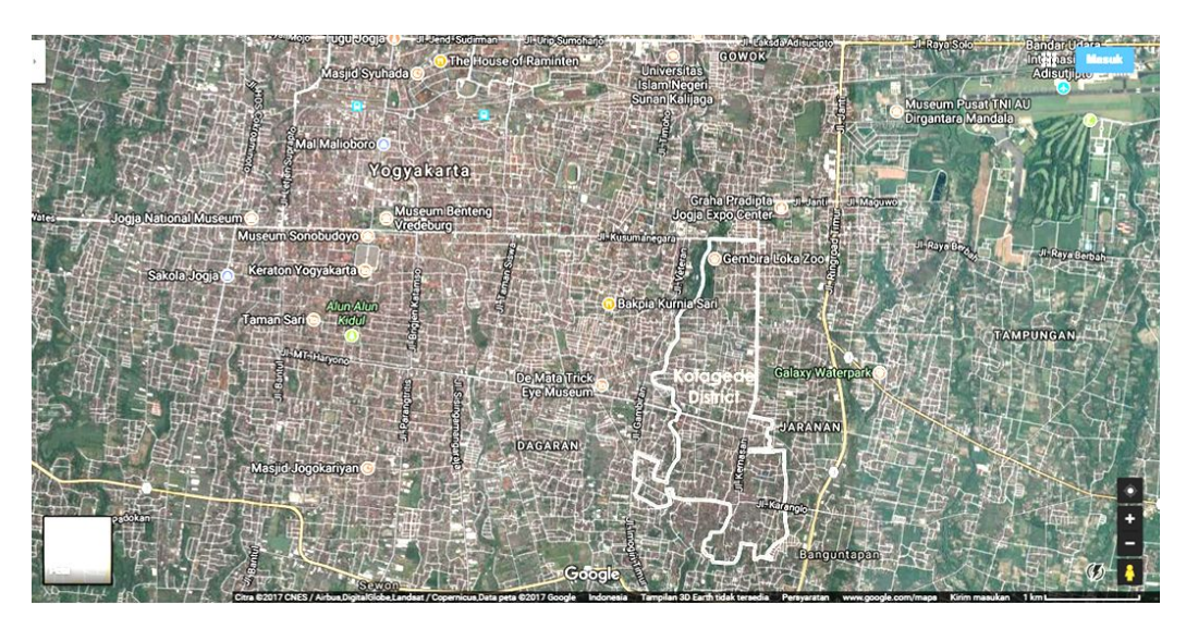
Figure 2. The location of Kotagede District, Yogyakarta

Kotagede District is located around 10 kilometres at southeastern of city center of Yogyakarta (Figure 2). It is now recognized as the center of silversmiths. As a former capital of the ancient Islamic Mataram Kingdom, Kotagede District has significant heritage sources. Jogia Heritage Society (2007) states that Kotagede has been built by Ki Ageng Pemanahan in sixteenth century and had a role as a center of Old Islamic Mataram Kingdom. Altough Kotagede does not have a function as a capital of a kingdom anymore, but it still revives historical sites which remains as collective memories for local residents. The sites in Kotagede still reflect components of capital of the Mataram Kingdom, i.e. the Palace (Kedhaton), Alunalun, Mosque, and Market, which is known as "catur gatra tunggal". There is no physical evidence of the Palace and Alun-alun (public open space), but the surrond settlements reflect the traces of history. Both of them have became settlements (Kampung Dalem and Kampung Alun-alun). Figure 3 shows the location of Kampung Dalem (T2), Kampung Alun-alun (T3), Pasar Kota Gede (T1), and Masjid Mataram (T4). These heritage sites also connect present living activities with the past. After the Independence of the Republic of Indonesia, the whole territory of Kotagede is in the province of Daerah Istimewa Yogyakarta (DIY). Today, Kotagede district is under two different administrative regions, Bantul Regency and Yogyakarta City.