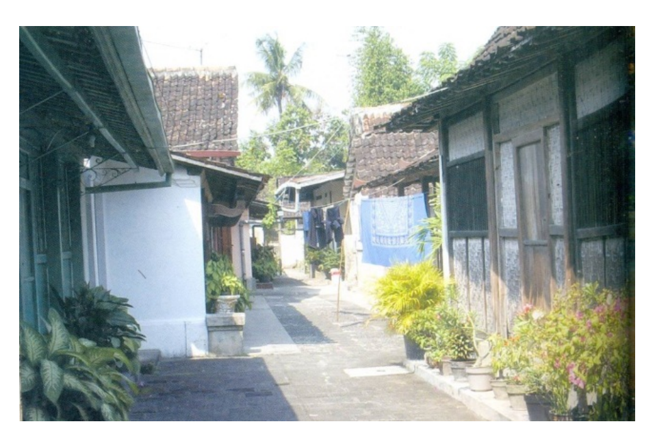
Figure 8. Kampung Alun-alun, Kotagede, Yogyakarta

There are toponyms of Alun-alun and Dalem. Kampung Alun-alun initially was Alun-alun (public open space) of The Mataram Palace, but today it is a settlement (Figure 8). It has been argued that the changes were occurred a long time ago before the lost of the old of Islamic Mataram Kingdom. Kampung Alun-alun is located at the eastern side of The Great Mosque, at the southern side of Pasar Kotagede, and at the northern side of Kampung Dalem. Based on the location, it has been interpreted that Kampung Alun-alun is the former Alun-alun of the old Islamic Mataram Kingdom.