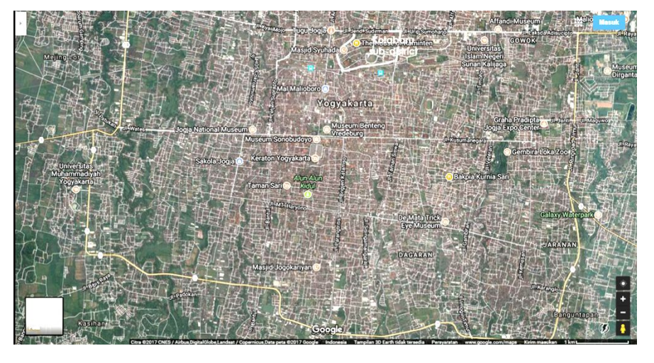
Figure 4. The location of Kotabaru sub-district, Yogyakarta