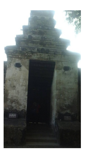
Figure 7. Gate into The Royal Cemetery, Kotagede, Yogyakarta