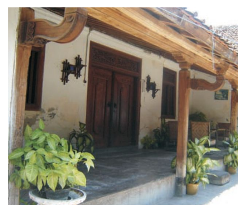
Figure 9. Bahu dhanyang, which supports the overhang, has an aesthetic function.