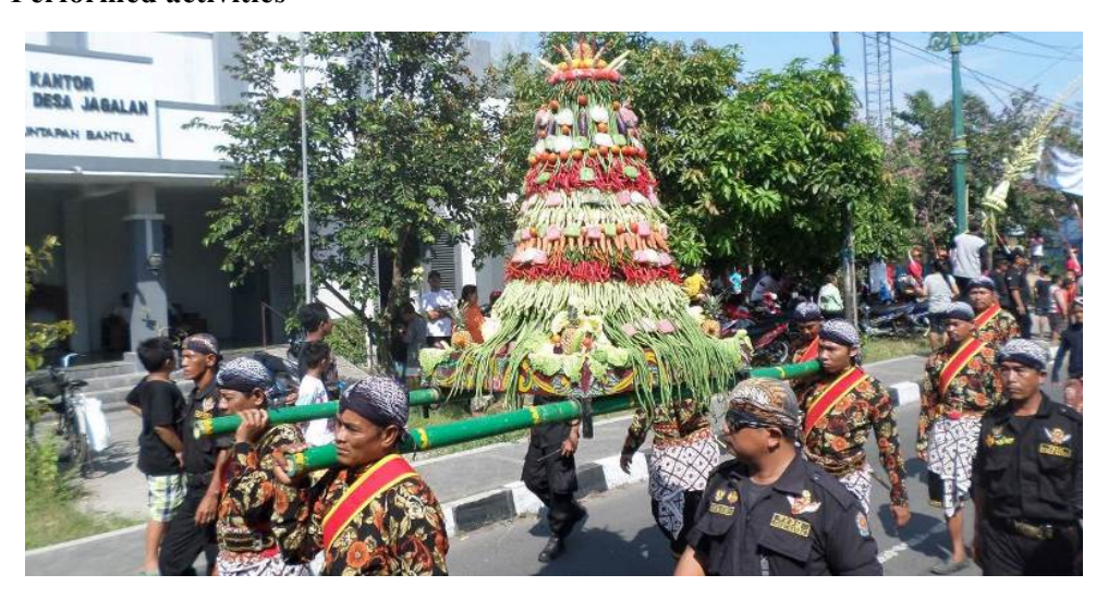
Figure 12. Ambengan Ageng Kotagede