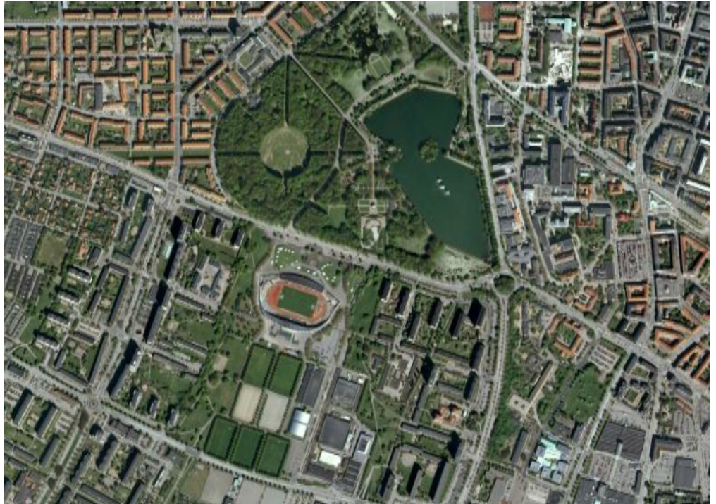
Computer generated image of Swedbank Stadium