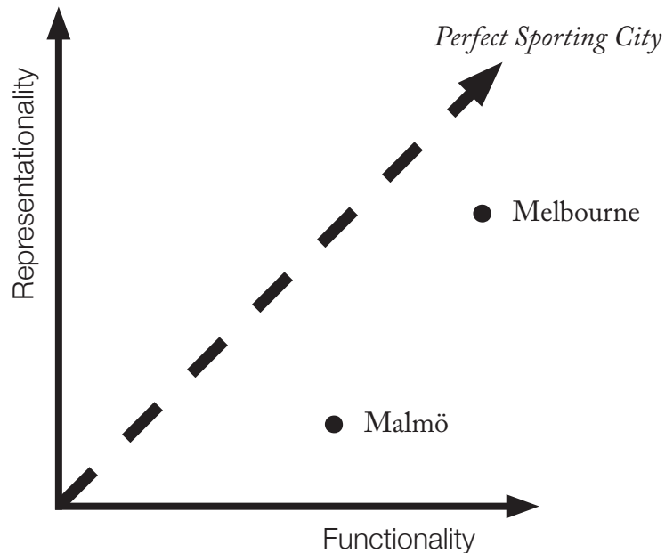
Figure 2: Case study cities plotted on Caldwell & Freire's adapted Brand Box model. Dotted line indicates direction sporting cities should be aspiring.

and culture. Essentially, people live in this city not for its beautiful scenery or good shopping, they live in this city because of the sporting culture and activity.