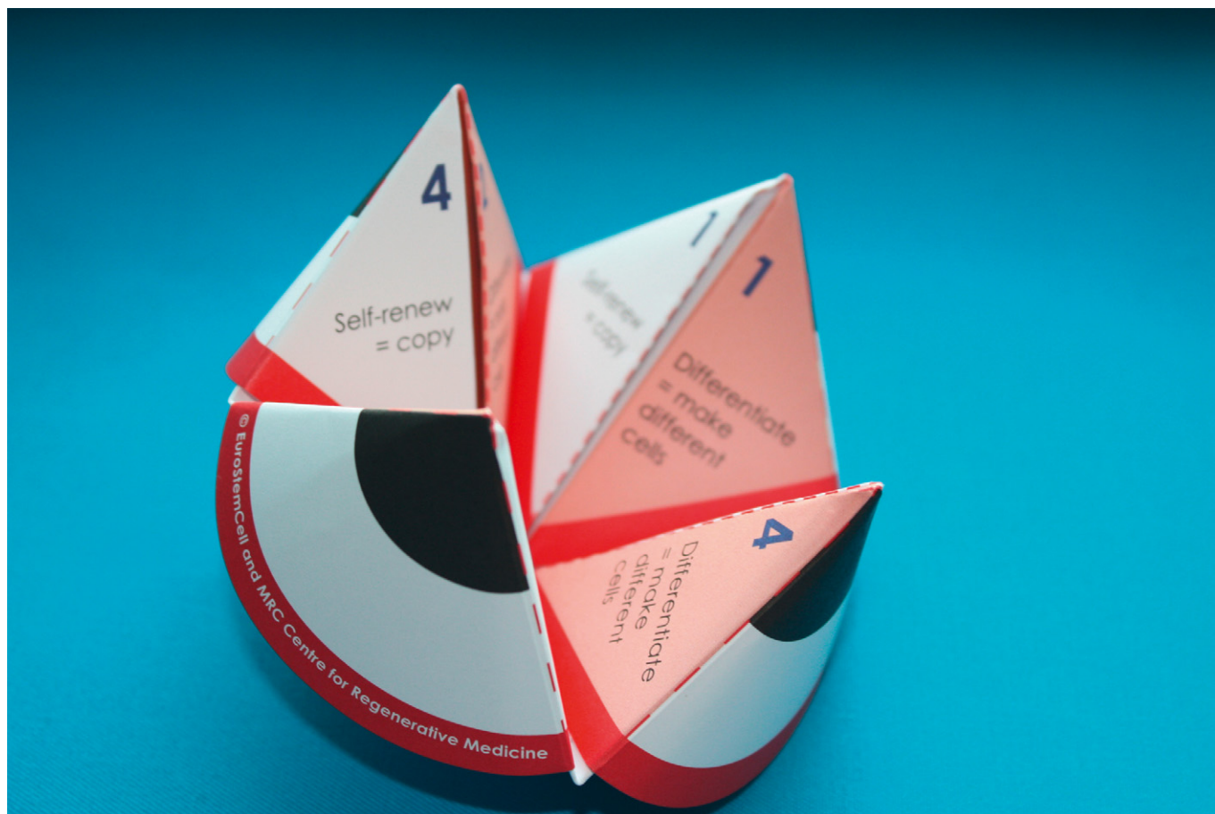
Figure 1. The stem cell decision-maker enables pupils to discover the properties of stem cells through a group game.

be readily substituted to increase flexibility. These lessons can thus meet the needs of researchers visiting schools in different contexts, or demands from teachers for interactive stem cell teaching aids. Activity-centred modules supported by simple graphics-based literature also constitute a format that is easily translated and updated. Our modules have, to date, been used by more than 240 colleagues throughout Europe and beyond.