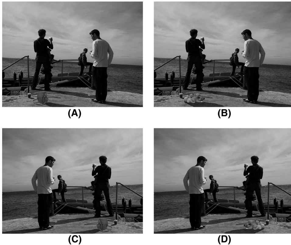
Figure 1. Example of scene presented to the participants. The four conditions of an example scene: neutral-left (A), emotional-left (B), neutral-right (C), and emotional-right (D). The neutral and emotional conditions differ by one item (bag/dogs), whereas the left and right conditions are the horizontally flipped versions of one another. Each participant was presented only one of the four conditions of every scene. Scenes were presented in full color.

(lower, respectively) in terms of valence than their neutral counterpart. More details on the procedure and results of the stimulus validation study are given in the Appendix.