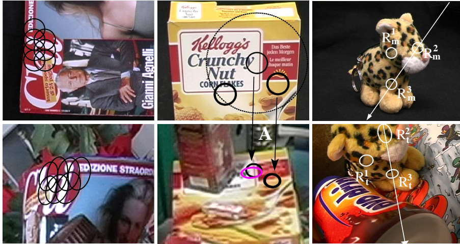
Fig. 3. Left: the regular arrangement of the regions is preserved. Middle: top: a candidate (thin) and 2 of 20 supports (thick) within the large circular area. bottom: the candidate is propagated to the test image using the affine transformation of the support on the right. Refinement adapts the shape to the perspective (brighter). Right: sidedness constraint. R^1 is on the same side of the line in both images.