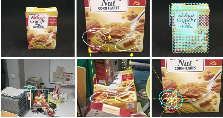
Fig. 2. Left: case-study (top: model image, bottom: test image). Middle: a closer view with 3 initial matches. The two model regions on the left are both matched to the same region in the test image. Note the small occluding rubber on the spoon. Right-top: the homogeneous coverage \Omega . Right-bottom: a support region (dark), associated sectors (lines) and candidates (bright).

The benefits of exploiting previously established geometric transformations was also noted by [13].