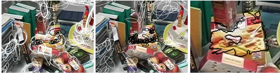
Fig. 4. Case-study. Left: 20 correct matches (dark) out of 330 after early expansion. Middle: 74/243 after the first main expansion. Right: contour of the final set of matches. Note the segmentation quality, in particular the detection of the occluding rubber.

Thanks to the refinement, each expansion phase adapts the shape of the newly created regions to the local surface orientation. Thus the whole exploration process follows curved surfaces and deformations.