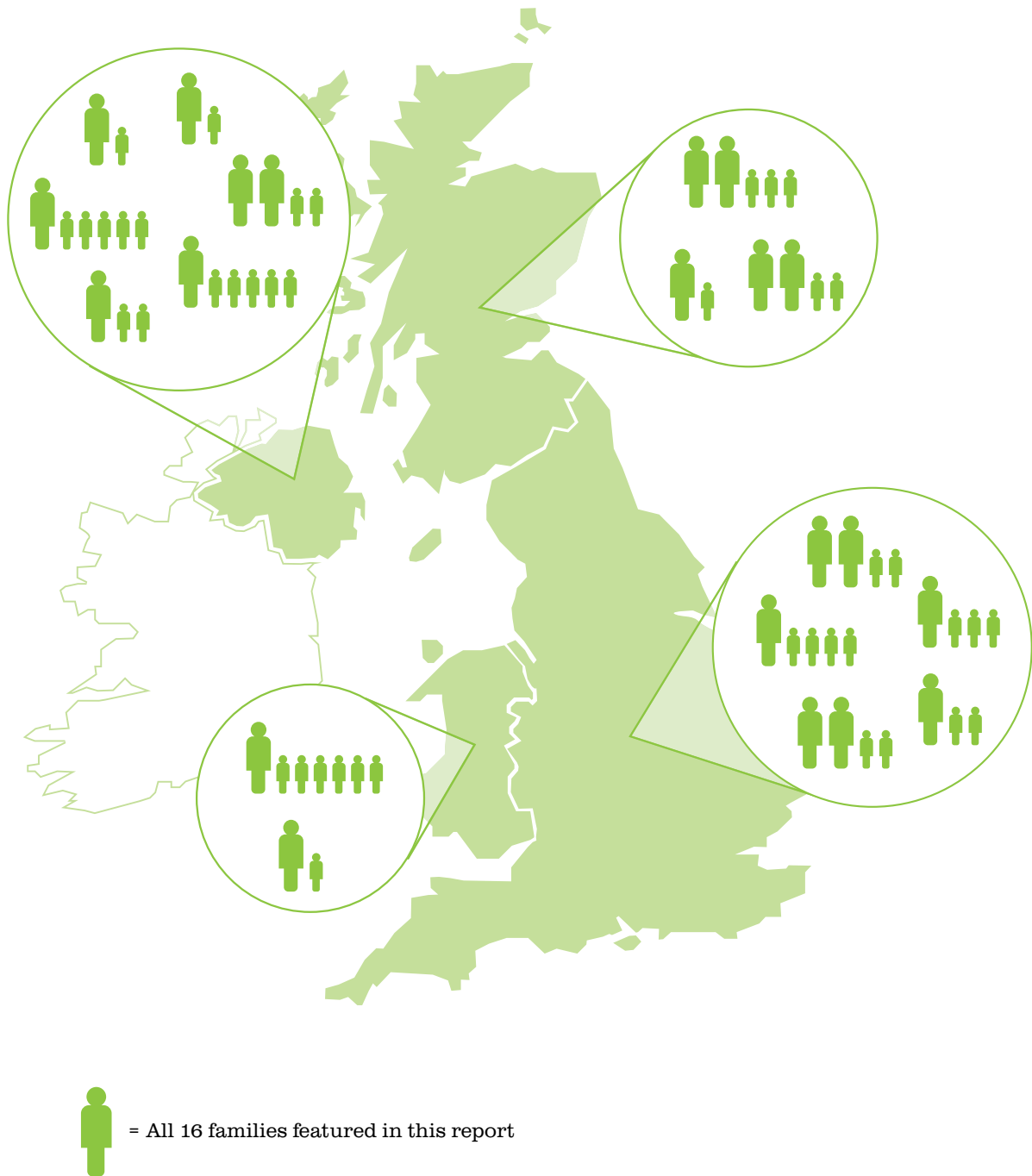
Figure 2: Geographical spread of families taking part in research