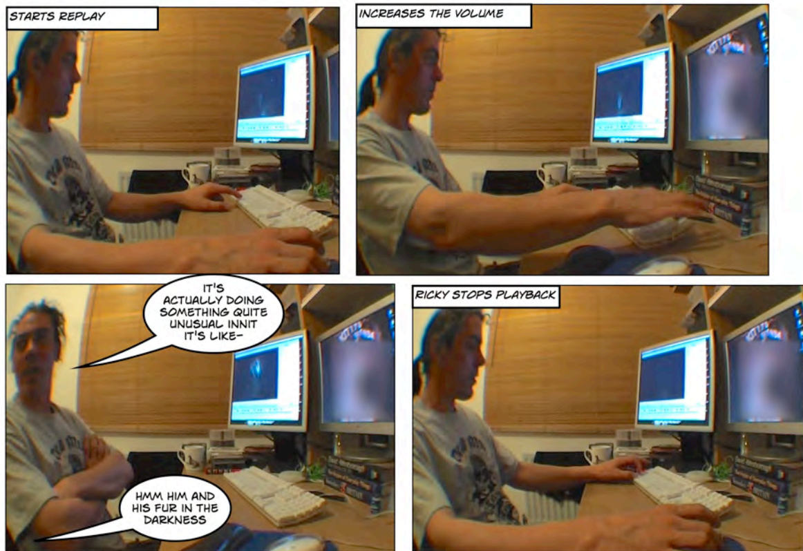
Transcript 4 (another camera perspective of transcript 3) – Embodying the investigation and assessment

There is also a change of participation framework in the editing here and one that is easier to see when you see the bodily configuration around the screen and keyboard: