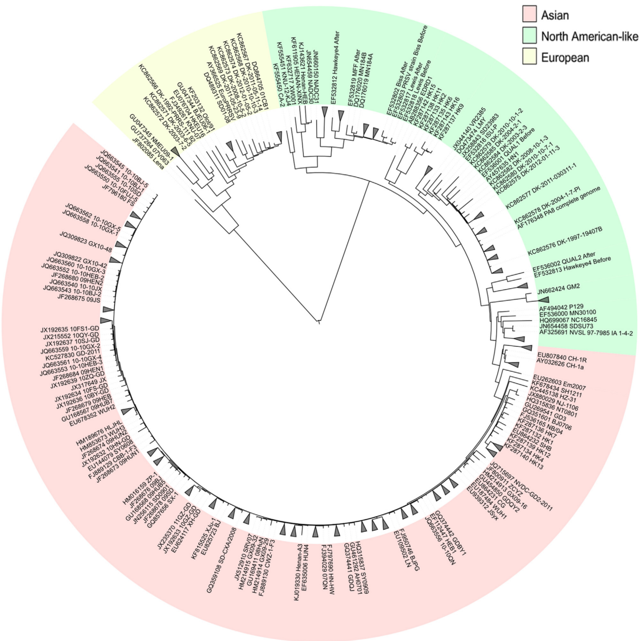
Fig. 1. Phylogenetic analysis of whole genome PRRSV strains. Whole genome sequences from 336 PRRSV isolates currently available in the Genbanks were aligned with the program MUSCLE. The unrooted maximum likelihood phylogenetic tree with 500 bootstrap replications was constructed using MEGA5 and the tree drawn with iTOL. Accession number of each sequence precedes the isolate's name. The two main clades separate the virus into the European genotype 1 and North-American-like/Asian genotype 2.

faster replication in the nasal mucosa have also emerged (Frydas et al., 2013). Similar to PRRSV Type 1, ongoing evolution within the PRRSV Type 2 genotype has been rather striking as well. In 1987, atypical PRRSV Type 2 strains were first identified in North America (Collins et al., 1992; Keffaber, 1989) but variant isolates/subtypes of these highly pathogenic PRRSV Type 2 strains have since spread to Asia (Li et al., 2007; Tian et al., 2007). Furthermore, microevolution within a coexisting quasispecies population has been found to further increase sequence heterogeneity in PRRSV (Goldberg et al., 2003). The dynamics of such mixed viral population is of increasing clinical importance with studies showing them affecting both virulence and pathogenesis (Domingo et al., 2012; Lauring and Andino, 2010).